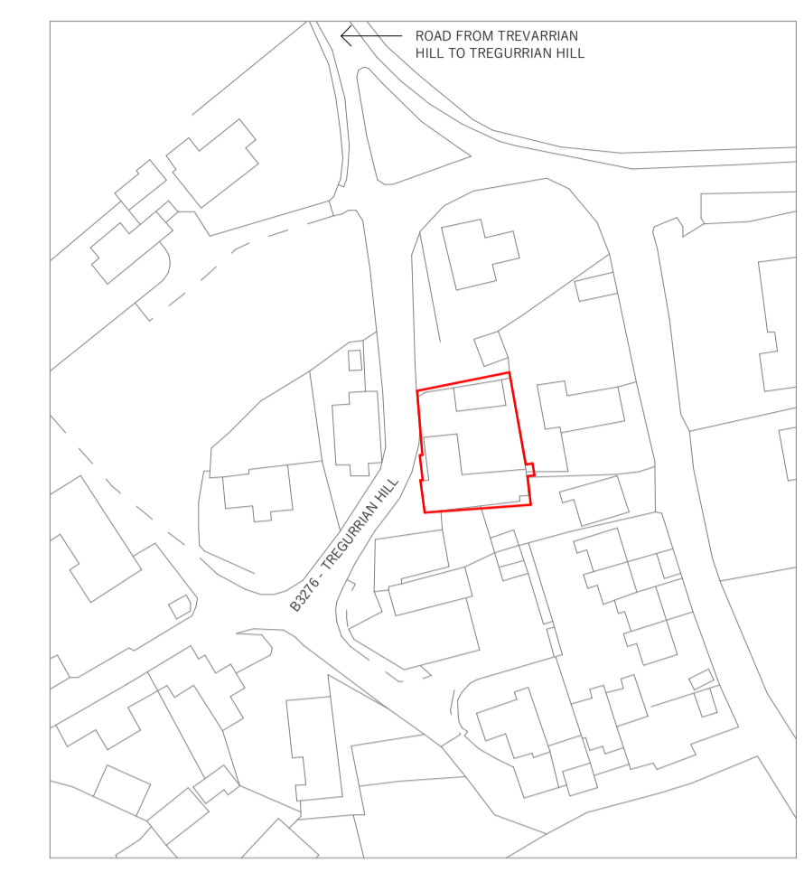
Location Plan 1 : 1250