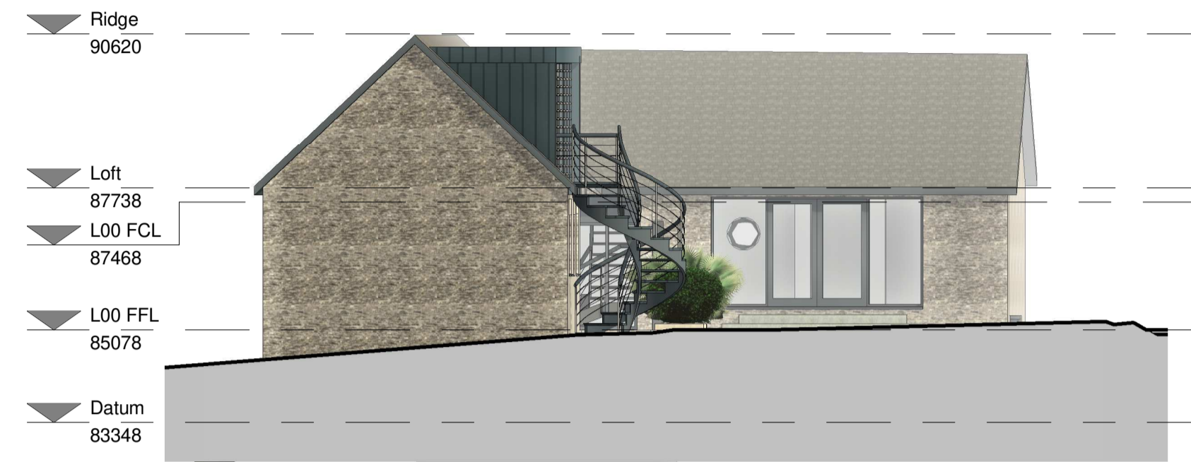
East Elevation 1 : 100