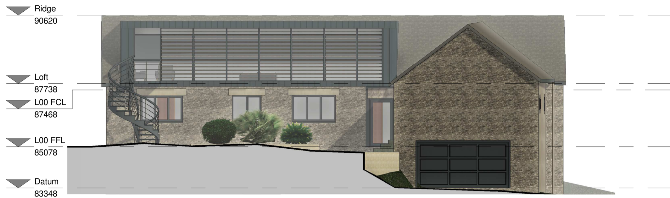
North Elevation 1 : 100