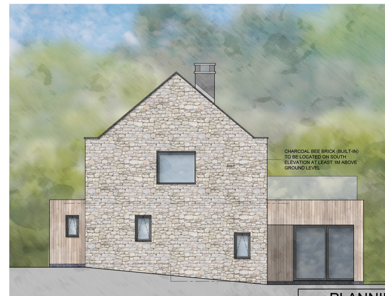
SIDE (SOUTH-EAST) ELEVATION