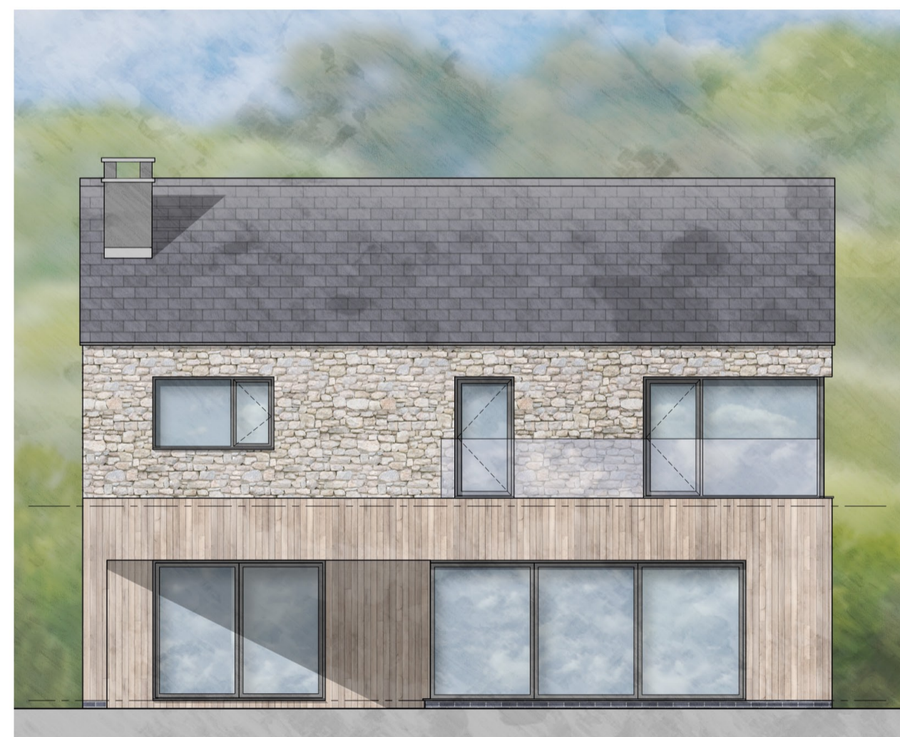
REAR (NORTH-EAST) ELEVATION