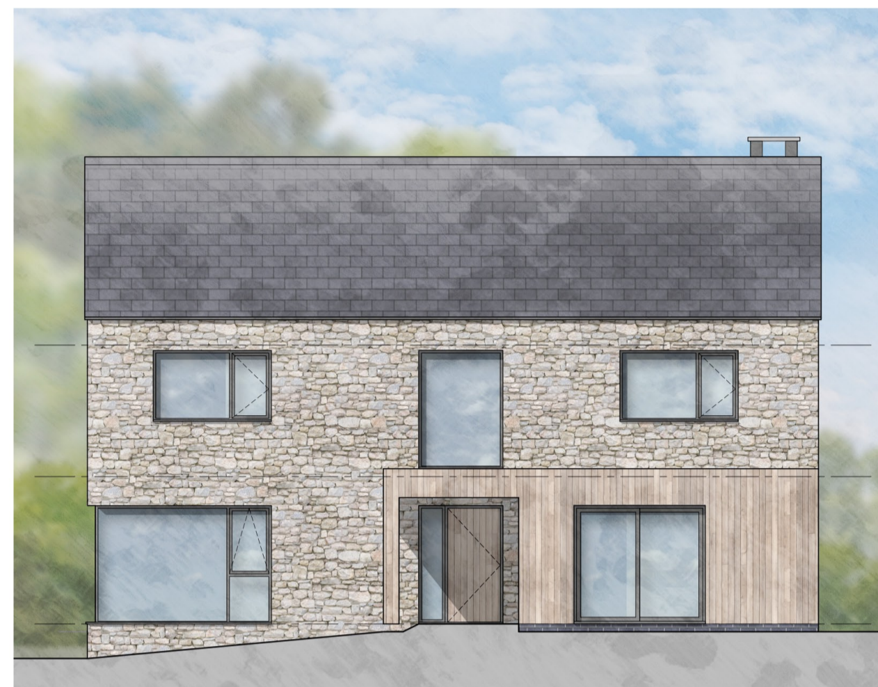
FRONT (SOUTH-WEST) ELEVATION