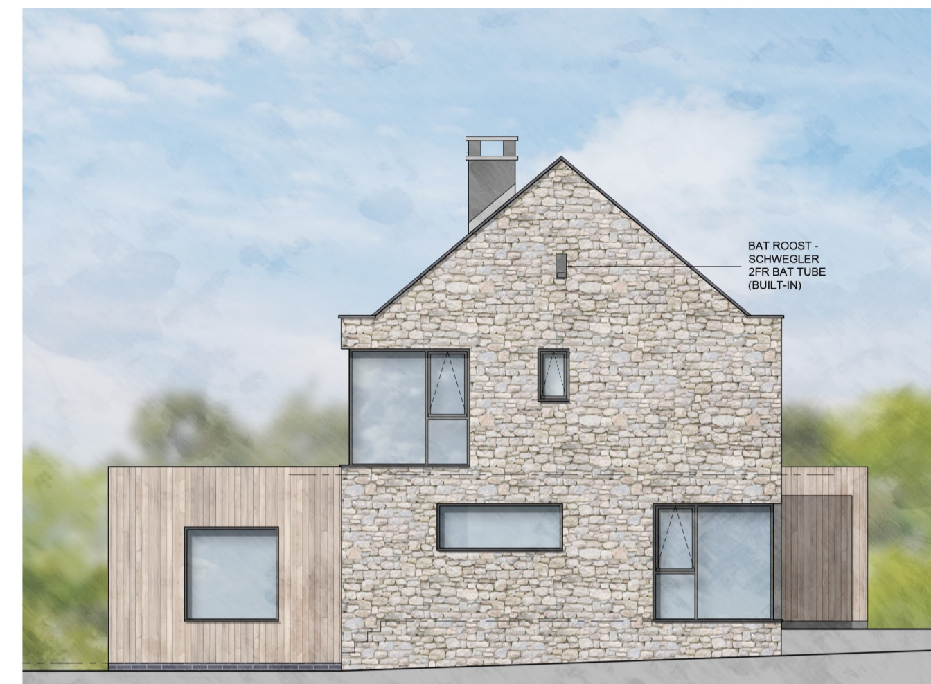
SIDE (NORTH-WEST) ELEVATION