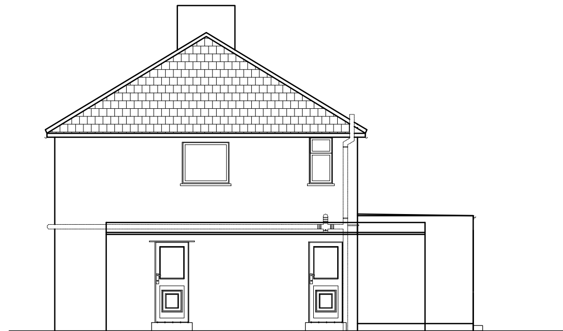
Proposed Side Elevation (no changes)