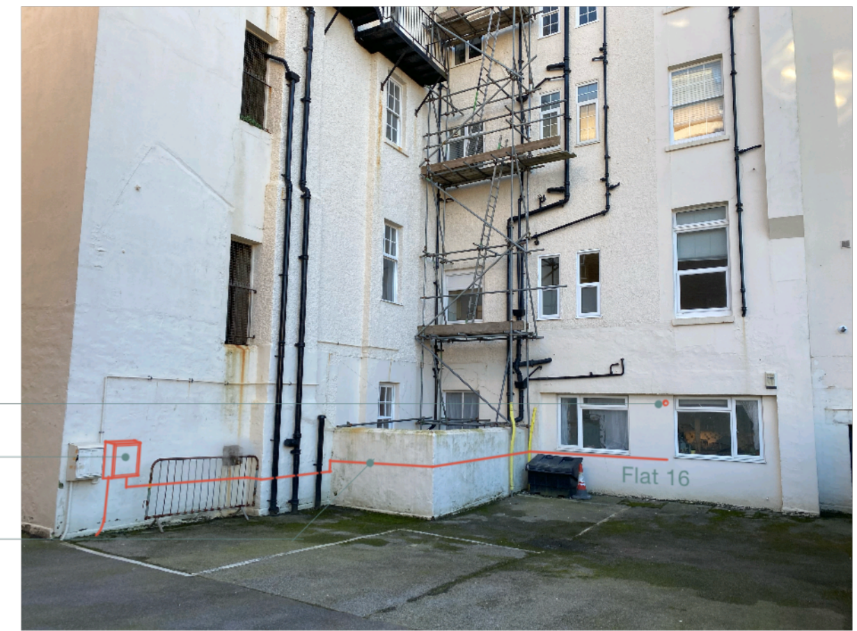
View 1 : Rear (north & west) Elevations