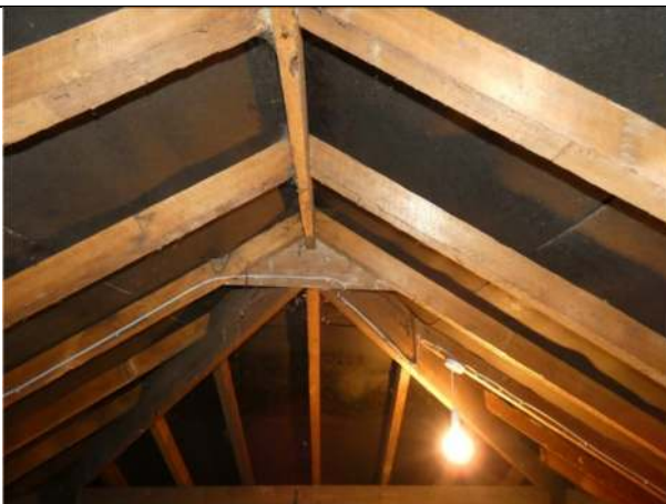
Photograph 15. The ridge area within the enclosed roof void