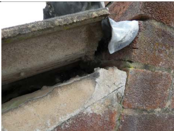
Photograph 11. Gap under a tile at the base of the west chimney