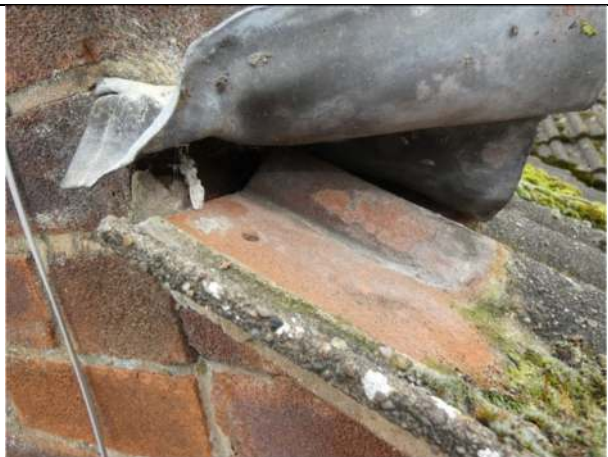
Photograph 10. The cavity under lead flashing at the base of the west chimney