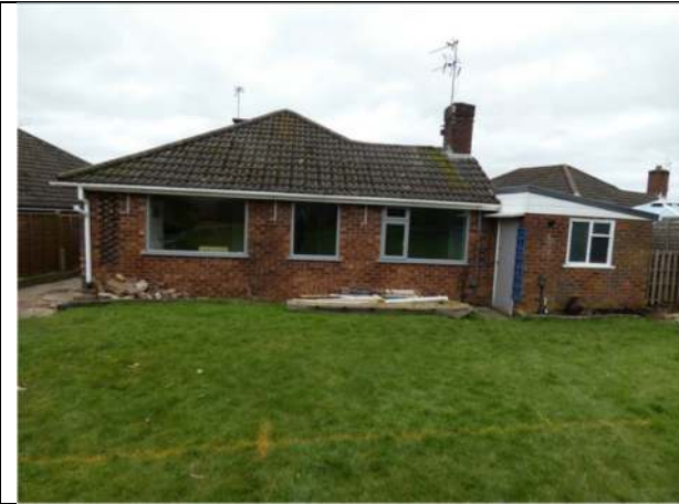
Photograph 3. The south elevation