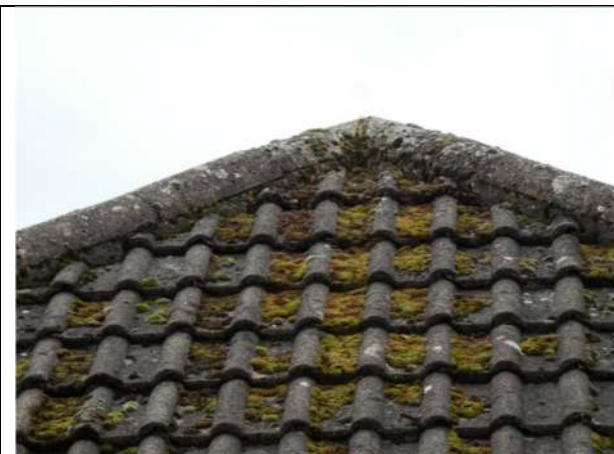
Photograph 5. Example of the roof tiles