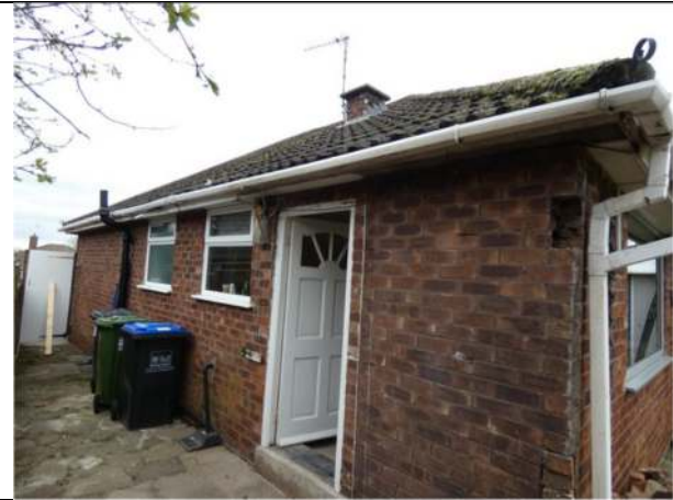
Photograph 4. The east elevation