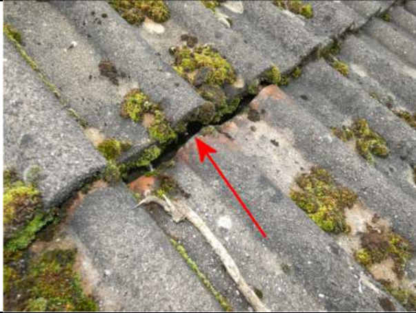
Photograph 7. Example of a slipped tile