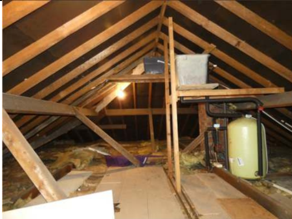
Photograph 13. The main section of enclosed roof void