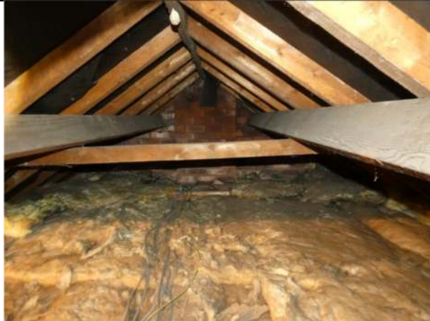
Photograph 14. The enclosed roof void within the gabled projection to the east