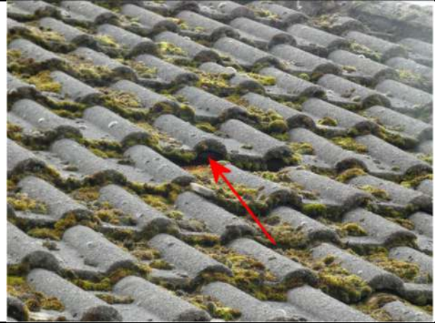
Photograph 8. Example of an opening under a roof tile