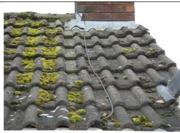
Photograph 6. Further example of the roof tiles