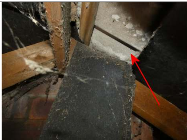
Photograph 16. Torn felt in the roof void exposing the cavity between the tiles, battens and lining