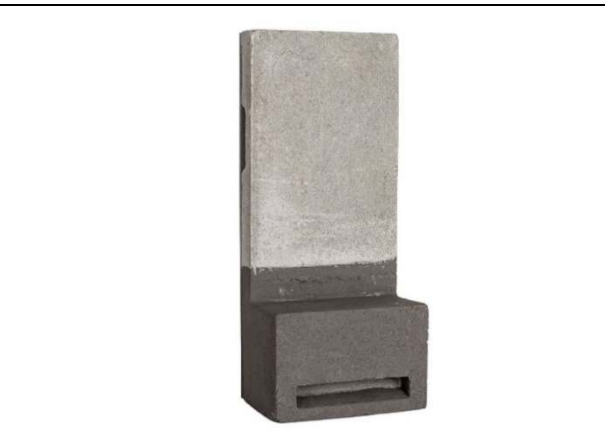
Photograph 18. PRO UK Build-in WoodStone Bat Box