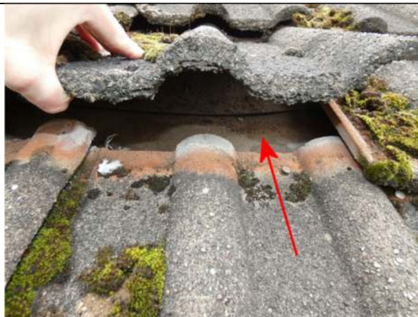
Photograph 9. The cavity under a slipped tile