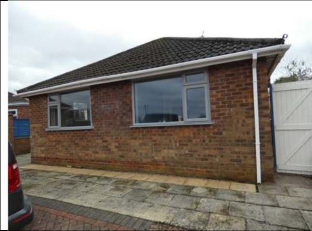
Photograph 1. The north elevation