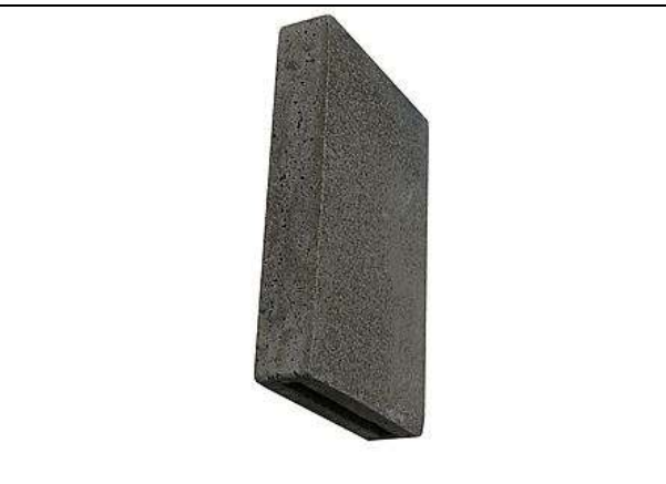
Photograph 17. Greenwood's EcoHabitats single cavity bat box