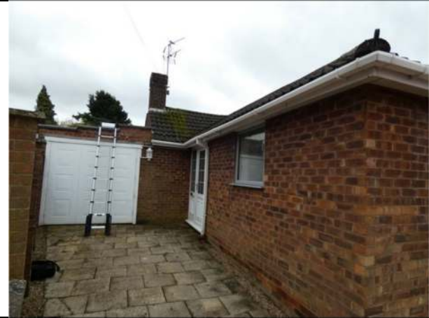
Photograph 2. The north and east elevations