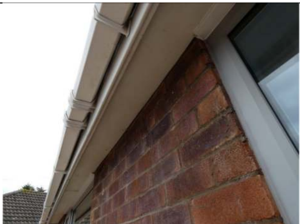
Photograph 12. Example of the sealed soffits