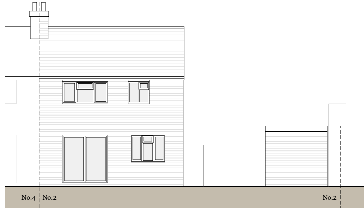
Rear elevation (north west)