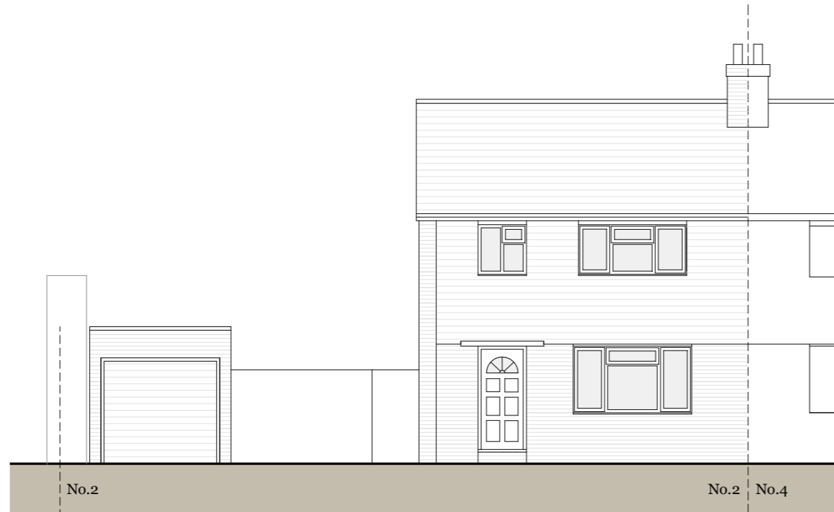
Front elevation (south east)