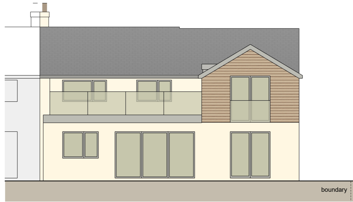
Rear elevation (north west)