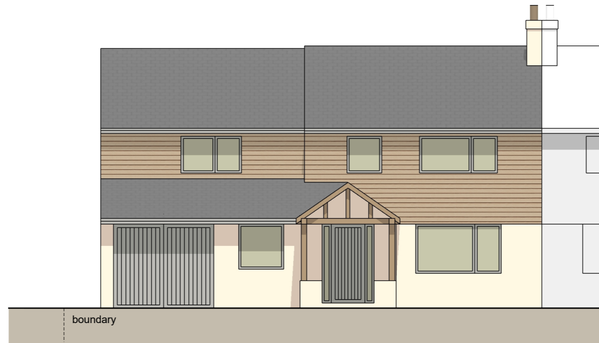
Front elevation (south east)