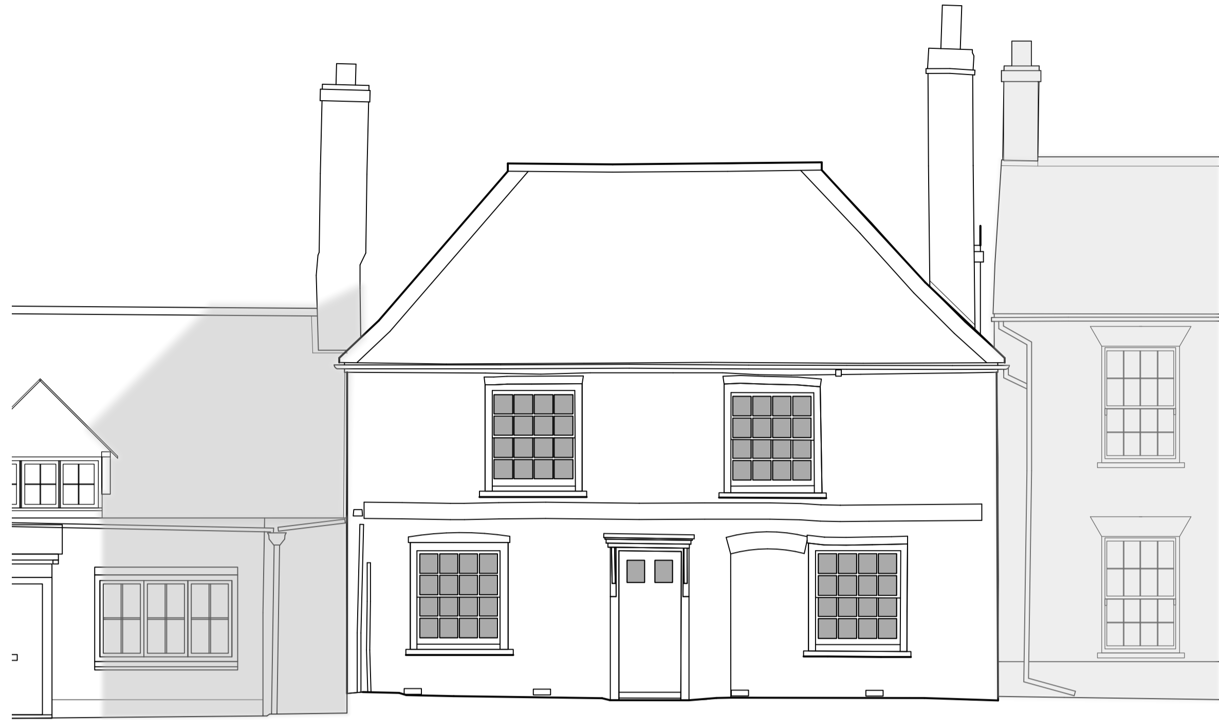
1 Front Elevation Scale: 1:50