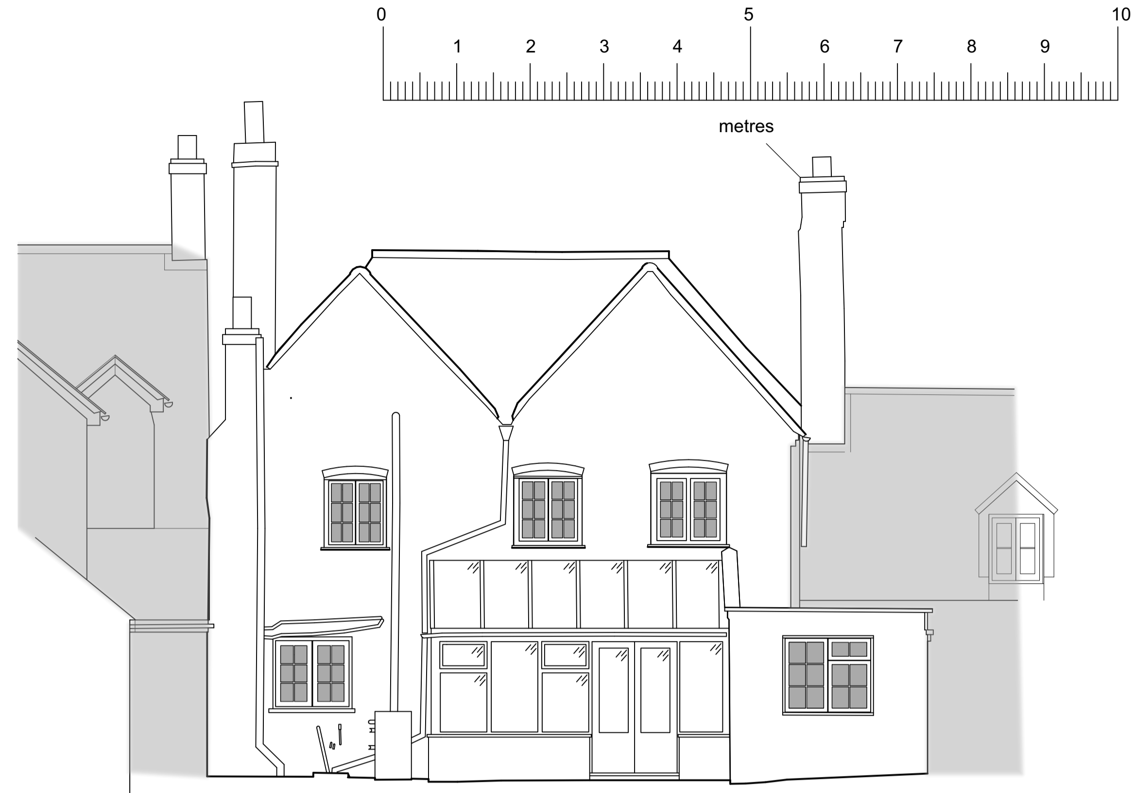
2 Rear Elevation Scale: 1:50