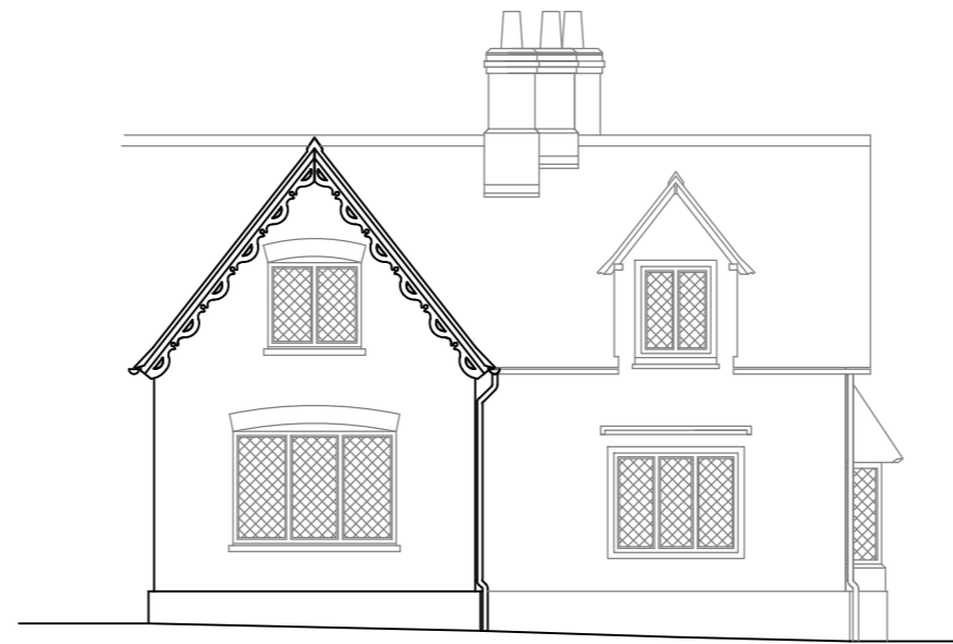
south east elevation