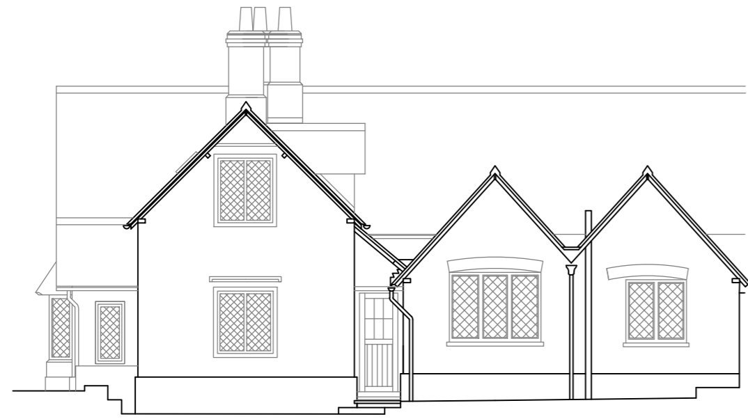
north west elevation