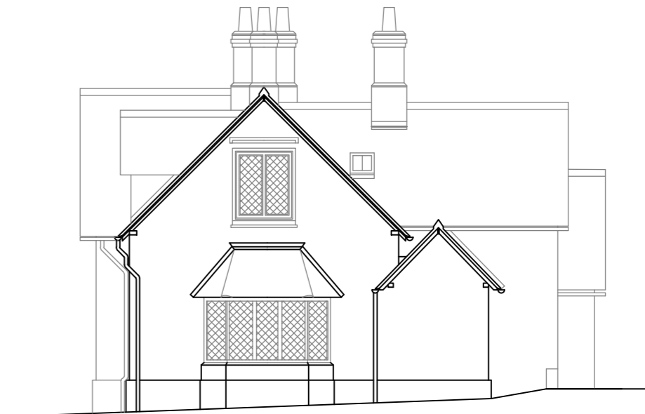
north east elevation