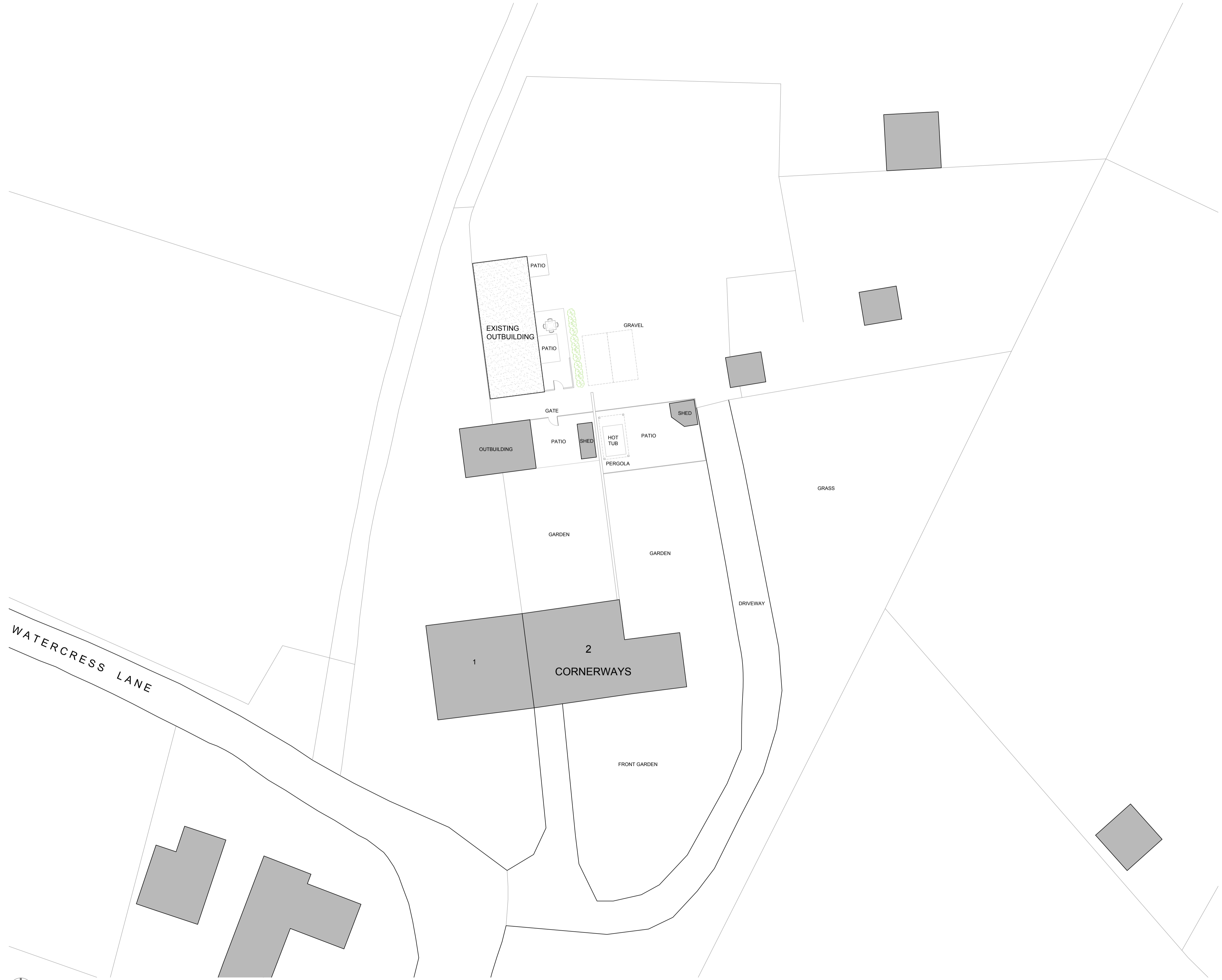
Existing Block Plan Scale 1:200

Notes Do Not Scale (unless for the purposes of planning). Report all discrepancies, errors and omissions. Verify all dimensions on site before commencing any work on site or preparing shop drawings. All materials, components and workmanship are to comply with the relevant British Standards, Codes of Practice, and appropriate manufacturers recommendations that from time to time shall apply. For all specialist work, see relevant drawings. This drawing is copyright of Kent Design Studio Ltd