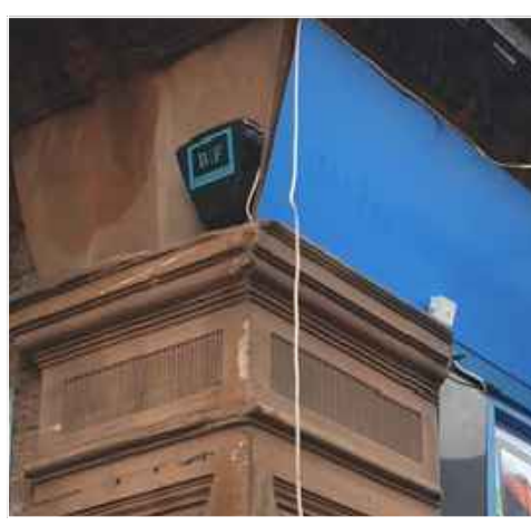
PHOTO OF EXISTING SIGN BACKING BOARD. BOARD TO BE RETAINED AND NEW SIGNAGE FIXED TO EXISTING BOARD.