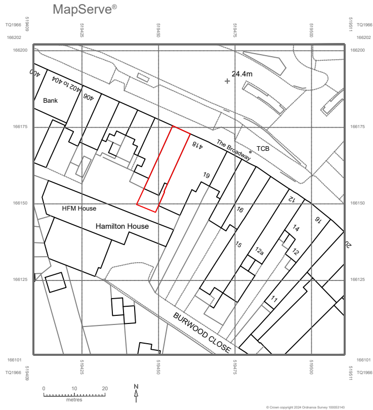
LOCATION PLAN 1:1250 @ A4