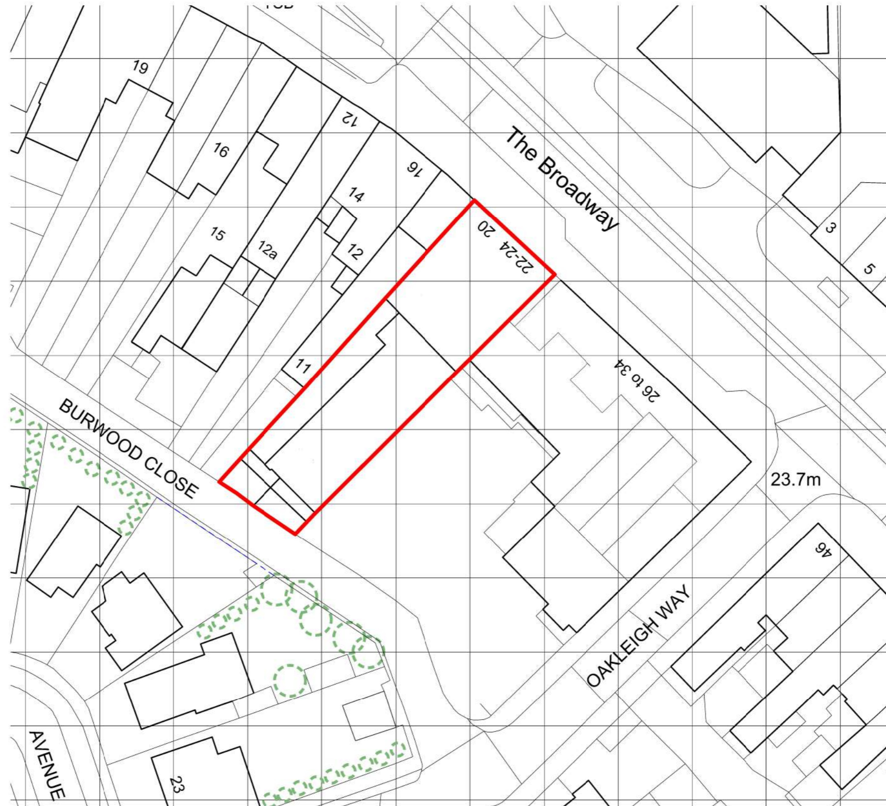
01. Existing Site Plan Scale 1:500