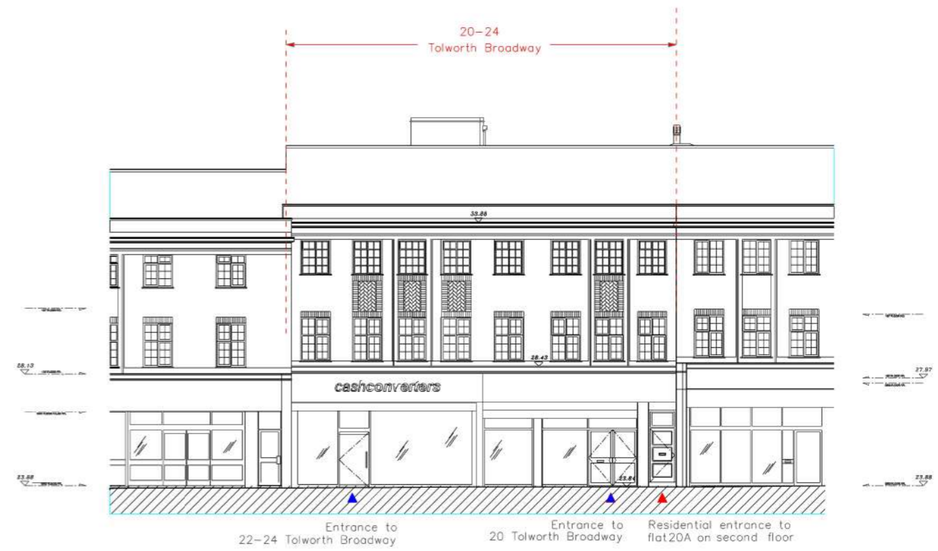
01. Existing Front Elevation (North) Scale 1:200