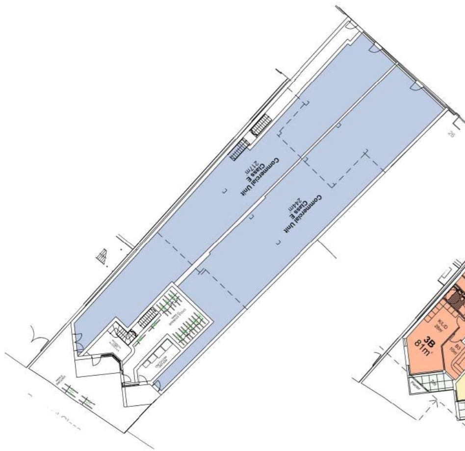
Proposed Ground Floor Plan Scale 1:400