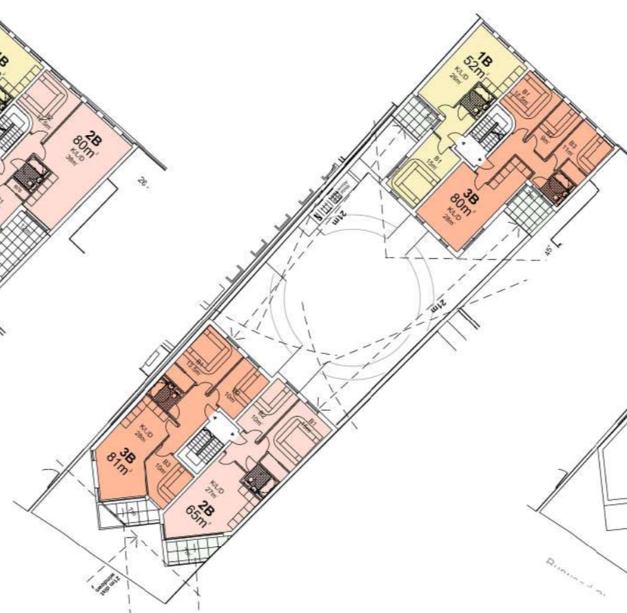
Proposed Second Floor Plan Scale 1:400