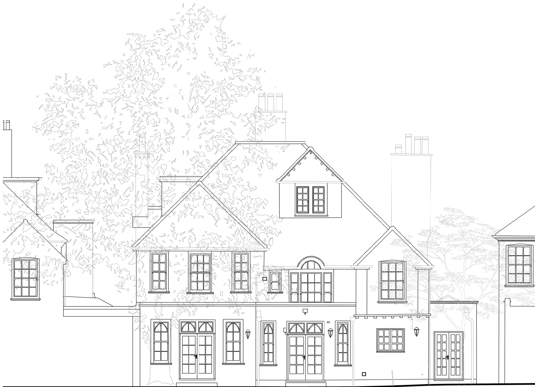
EXISTING REAR (WEST) ELEVATION Scale 1:100 @ A3