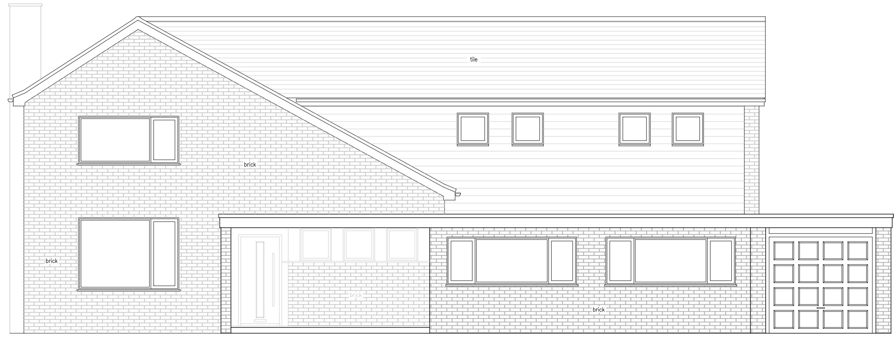
existing front elevation 1:50

NOTES: © TS DRAWING SERVICES all dimensions have been site surveyed by use of tape/laser tape and are as approximate the contractor is responsible for checking all dimensions on site prior to the commencement of work. all works to be carried out the satisfaction of the local authority building inspector and in accordance with the latest nhbc standards.