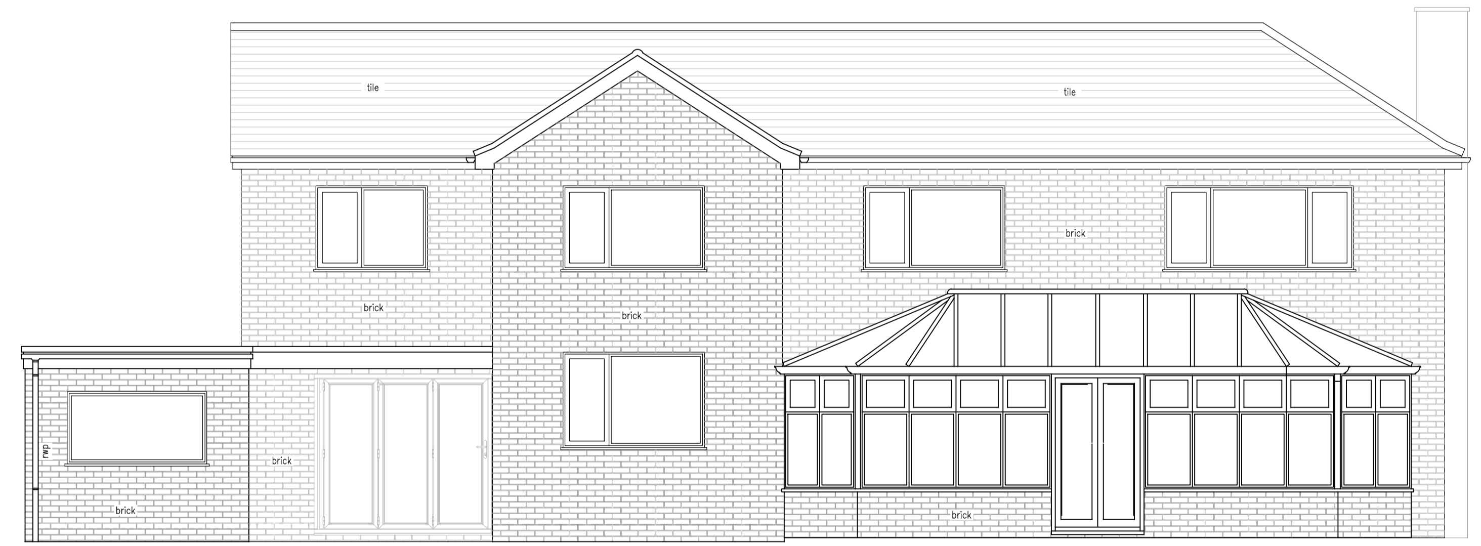
existing rear elevation 1:50