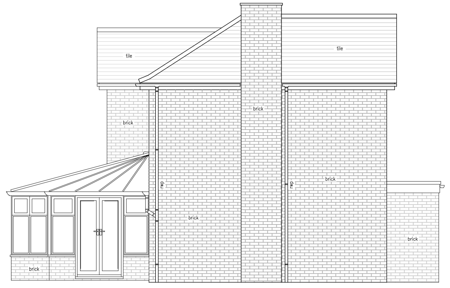
existing left side elevation 1:50