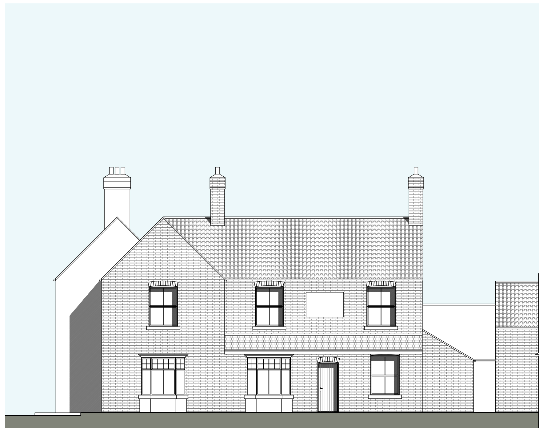
01 EXISTING SIDE ELEVATION 1:100