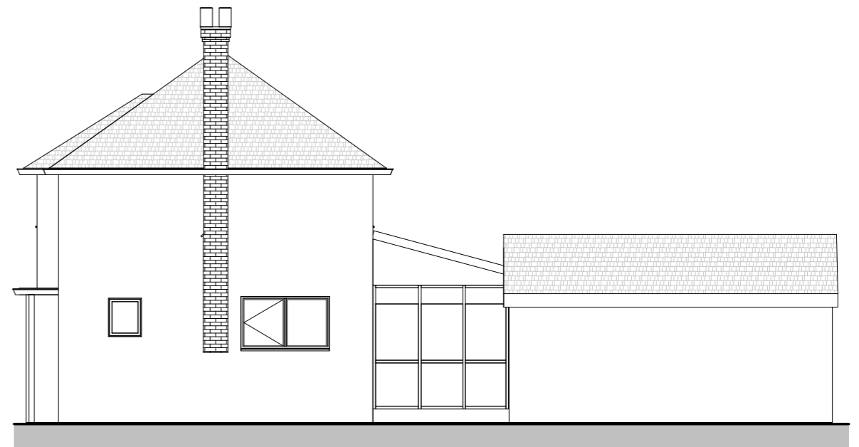
4 Side - South 1 : 100