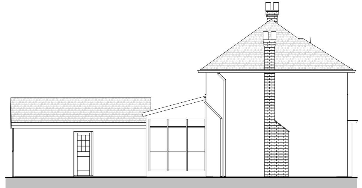
2 Side - North 1 : 100