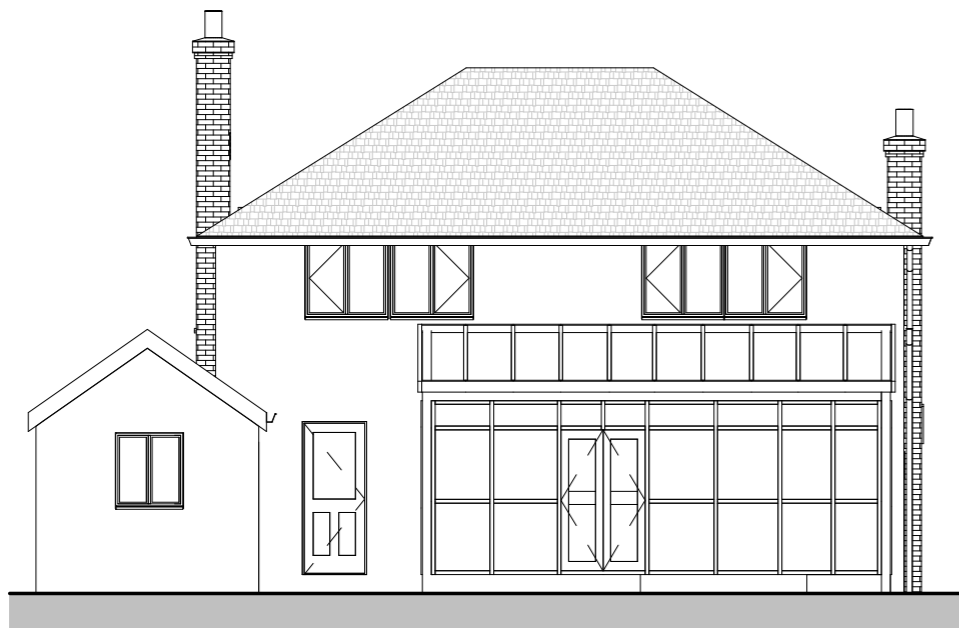
3 Rear 1 : 100