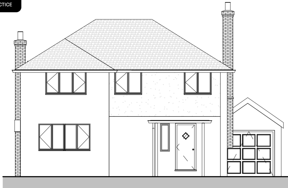
1 Front 1 : 100