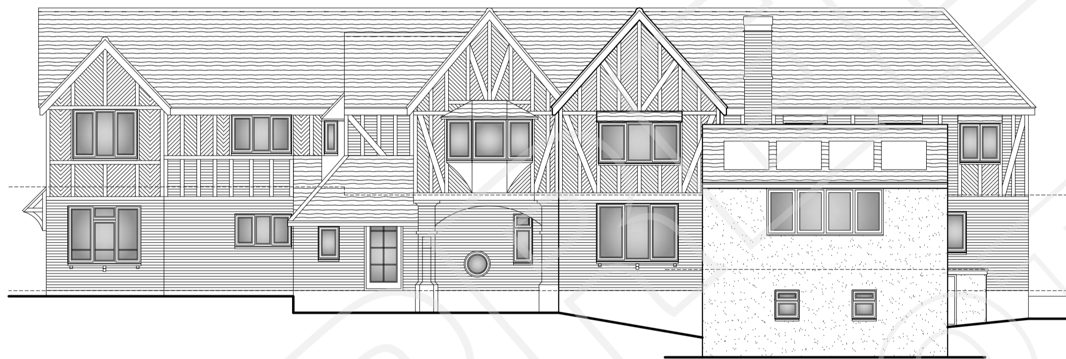
REAR ELEVATIONS 1:100