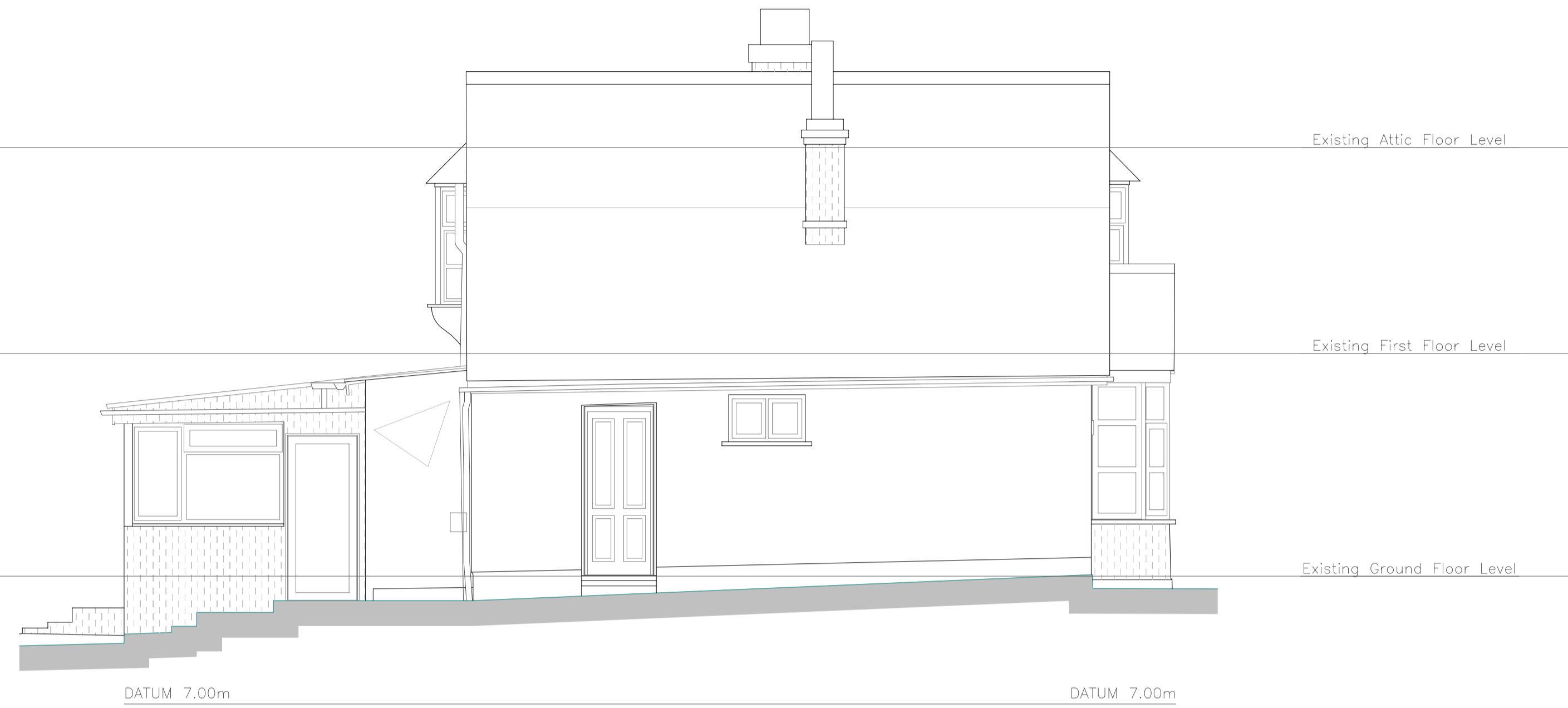
EXISTING LEFT SIDE ELEVATION