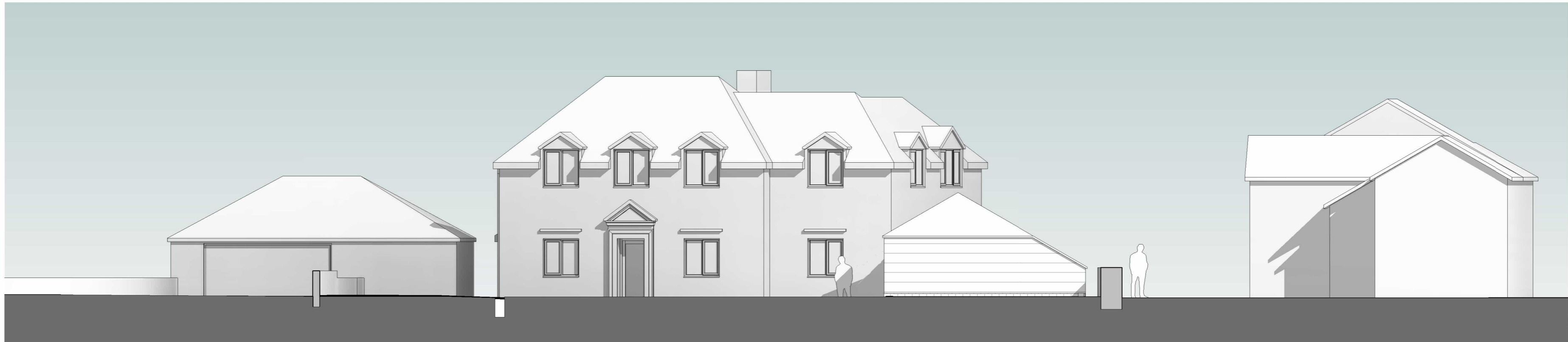
2 PROPOSED ELEVATION 1:100