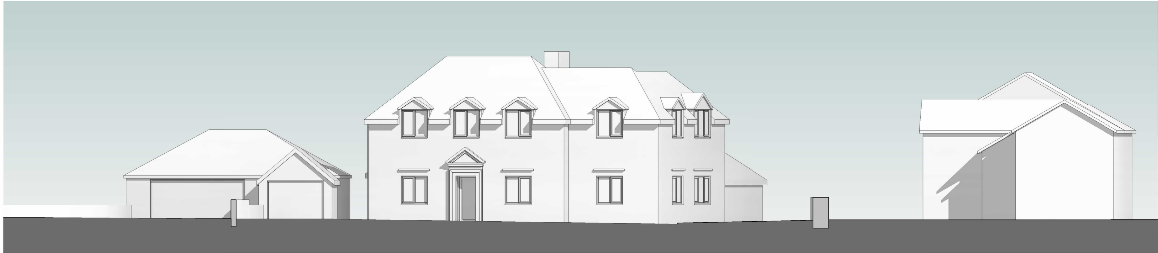
1 EXISTING ELEVATION 1:100