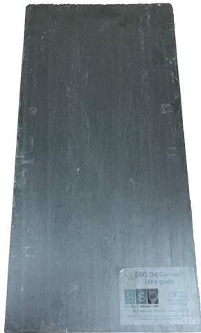
SSQ Del Carmen natural slate

A high-quality natural slate is proposed, such as the SSQ Del Carmen blue-black natural slate or equivalent (subject to availability) as shown below. A sample slate will be provided on site alongside the sample stone panel.