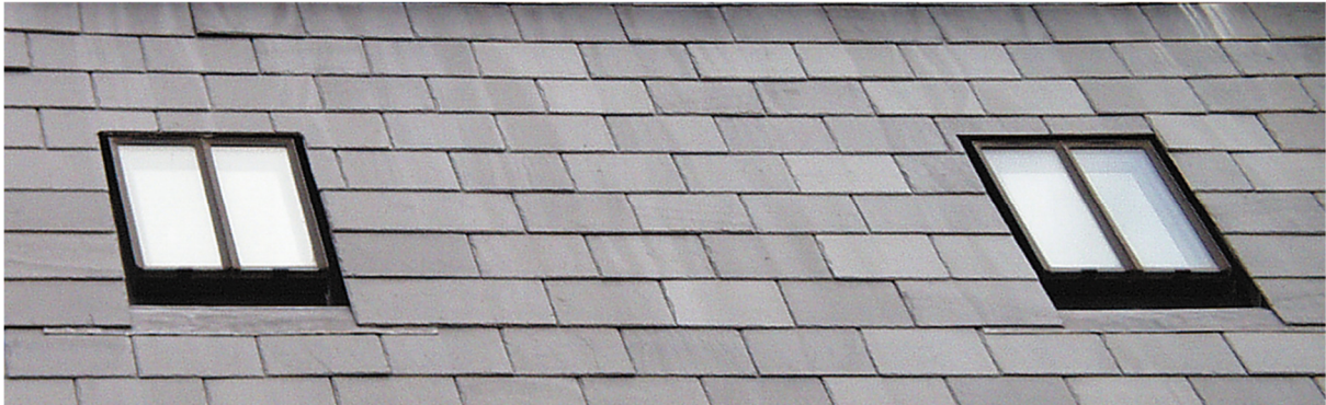
Typical conservation rooflight installation in slate roof finish

Rooflights to be 'The rooflight company', flush fitting conservation type with vertical glazing bar, ref. CR01-2, size 565 x 725mm: