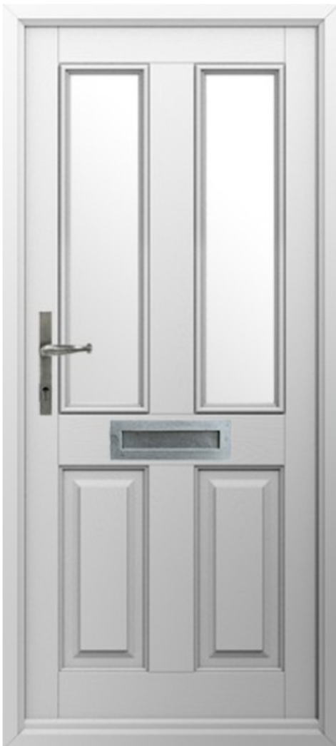
Typical composite door

Front entrance door to be timber composite: