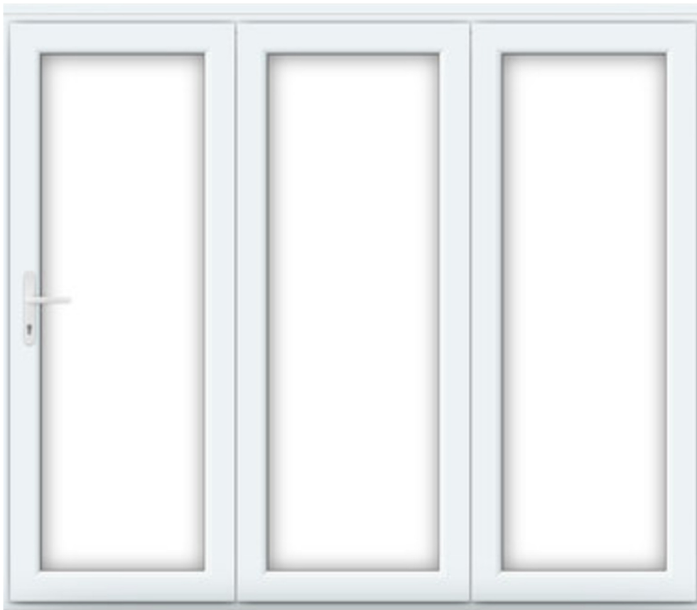
Typical uPVC bifold doorset

Bifold doors to be white uPVC frames, with double glazing: