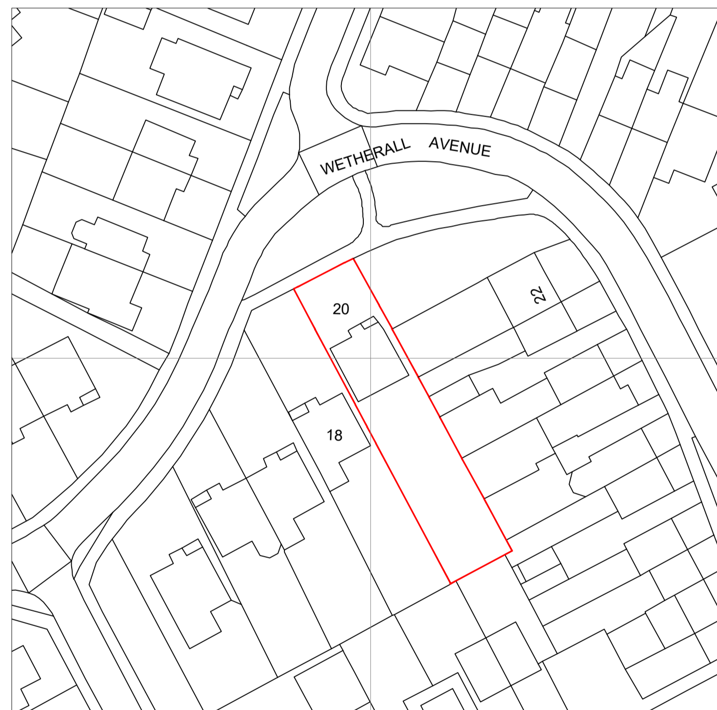
SITE LOCATION Scale 1:500