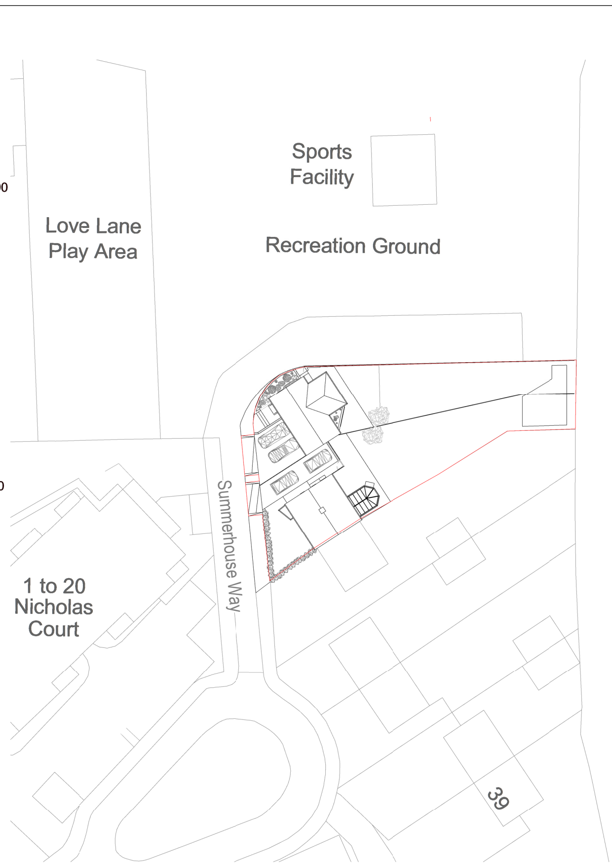
BLOCK PLAN 1 : 500 @A3