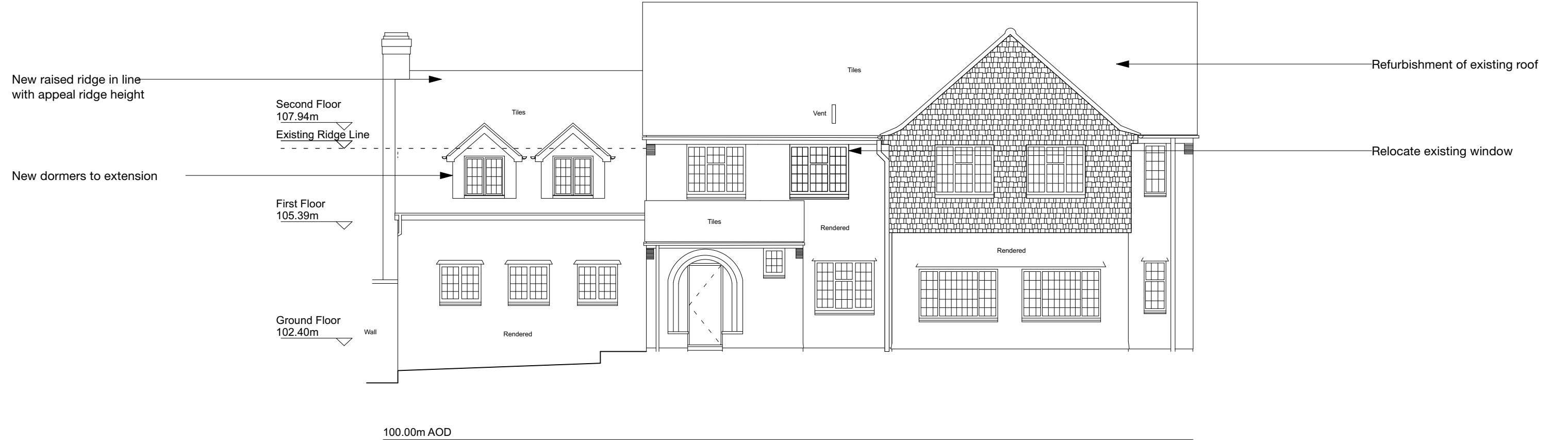
Elevation A - Front

Project: 2134 : Loudwater Heights, Chorleywood Herts WD3 4AX Title: Proposed Elevations Dwg No: 2134_401 Purpose: PLANNING Scale: 1:100@A3 Revision: B ©Confidential copyright Tye Architects under berne & universal copyright convention. Information contained within this drawing is the sole copyright of Tye Architects and is not to be reproduced without their express permission. This document must not be copied without written permission and the contents must not be imparted to a third party nor be used for any unauthorised purpose.