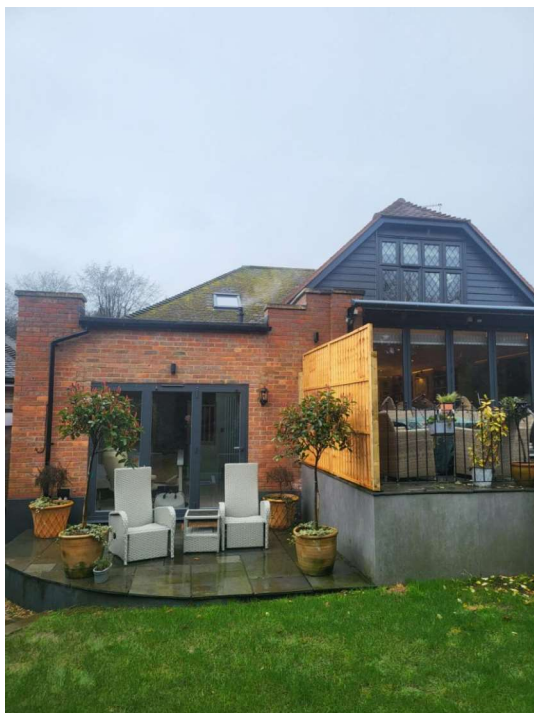
Picture 3 - Existing Terrace.