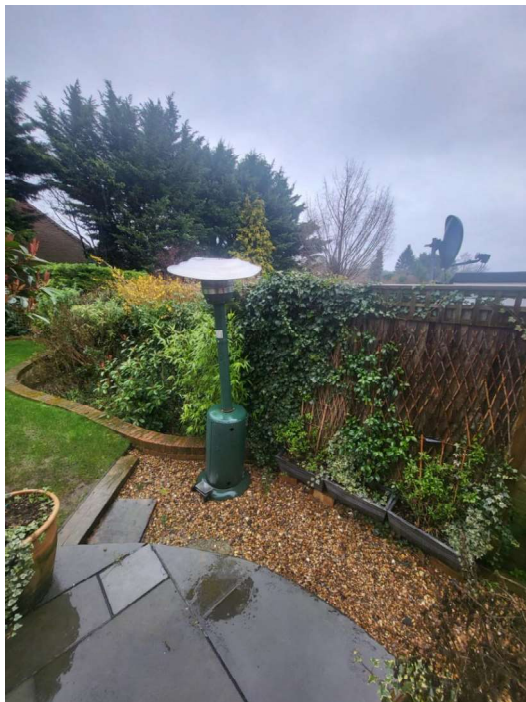
Picture 1 - From terrace from a height of 1.9m