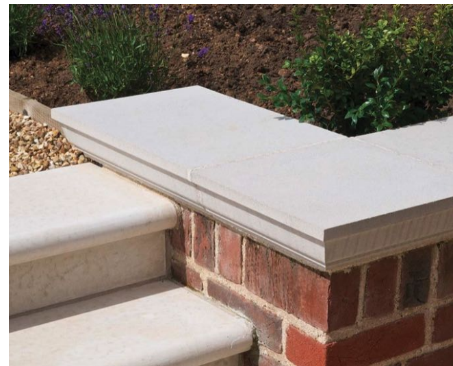
Precast copings to parapets