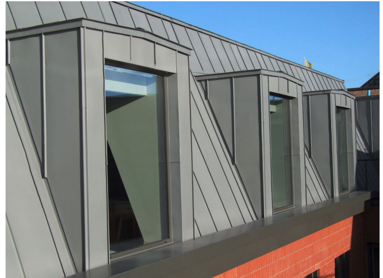
Zinc mansard roof with dormers