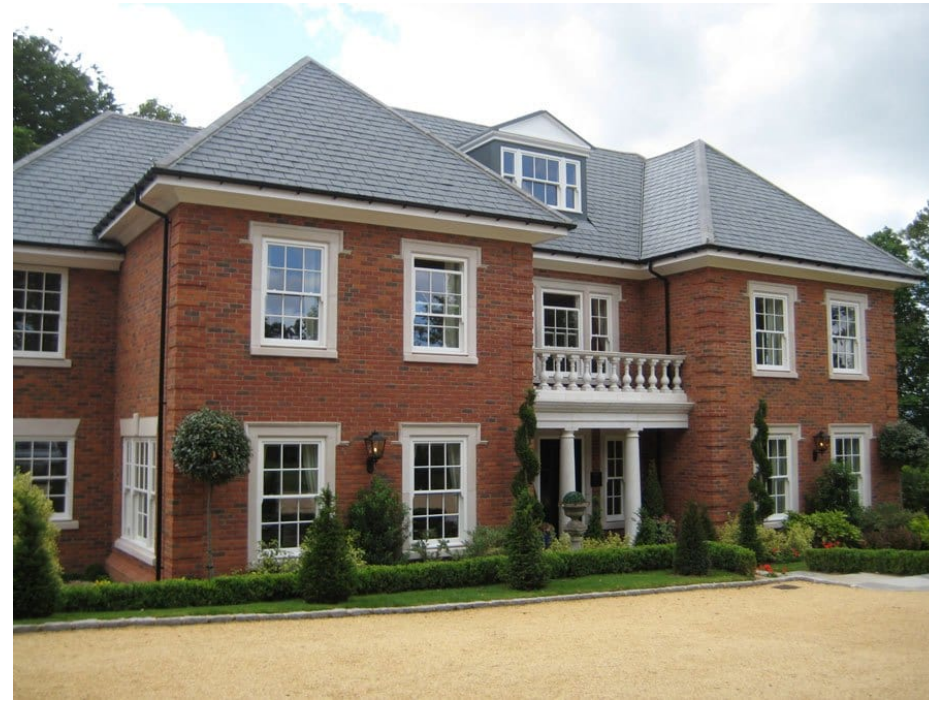
Above: Examples of new builds using the Michelmersh brick