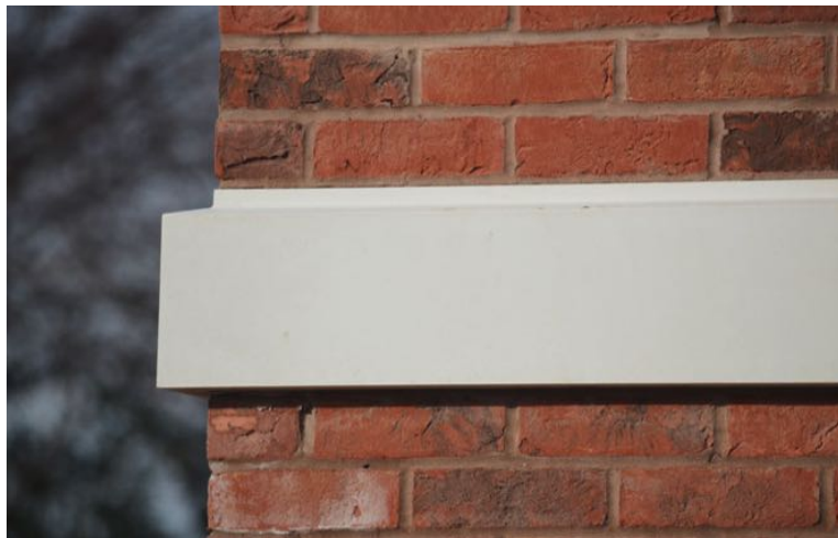
Precast string course dressing to brickwork