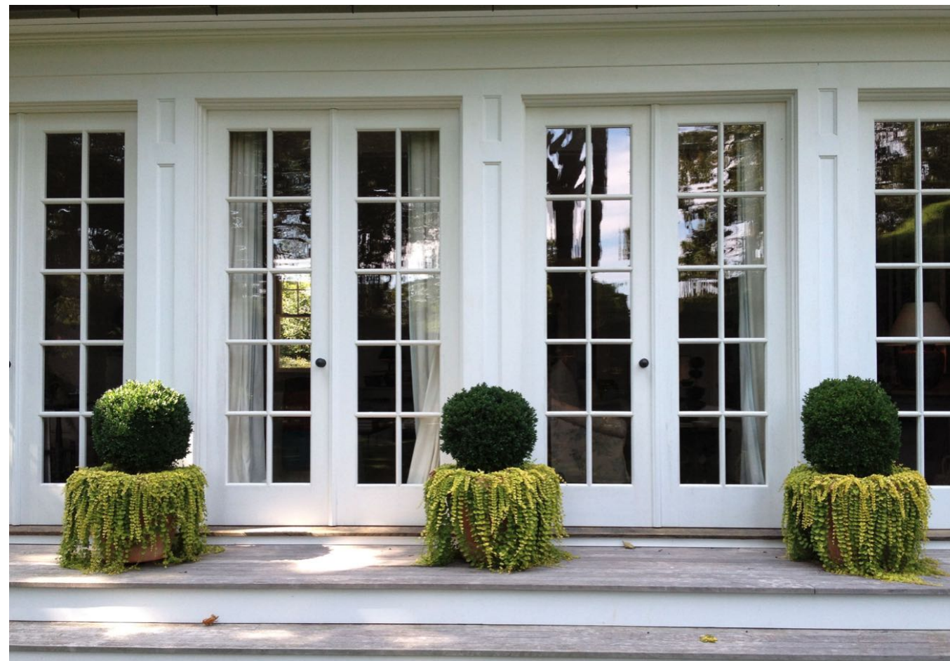
Timber frame French doors