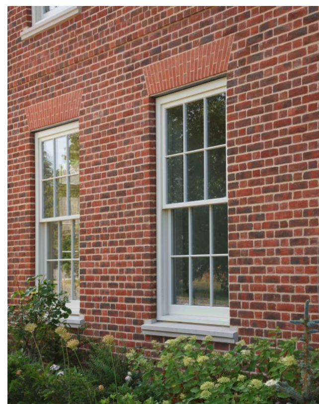
Sash windows in brickwork with precast stone cills