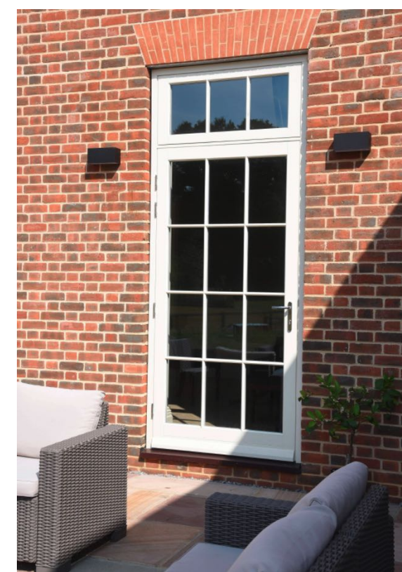
French door in brickwork