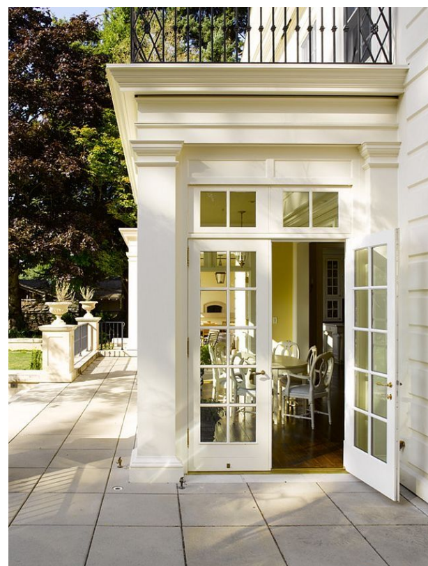
Timber frame french doors in classical surround