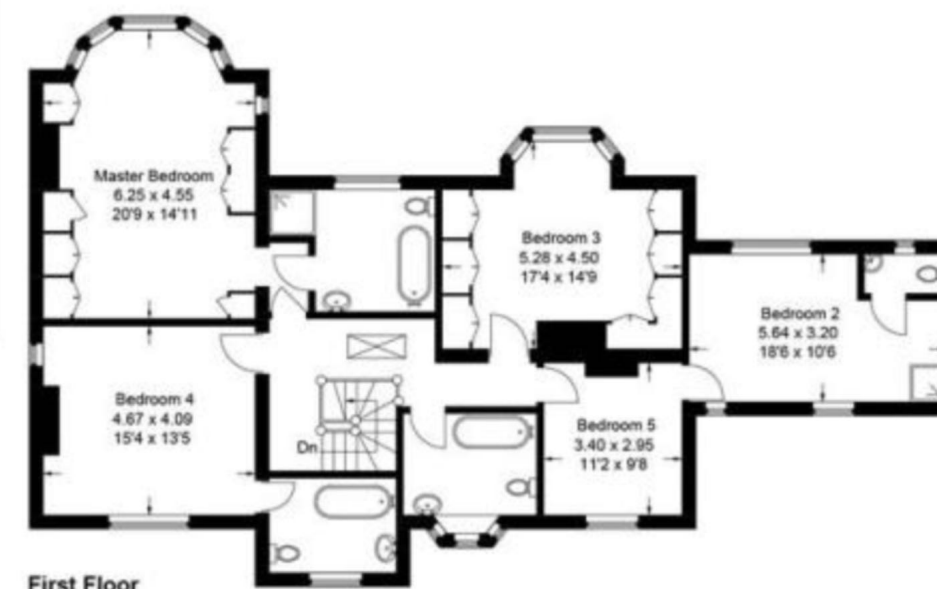
1st Floor Plan as Existing