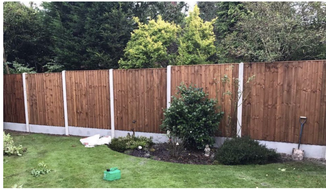
Close boarded fences to side and rear boundaries with precast concrete base boards and posts