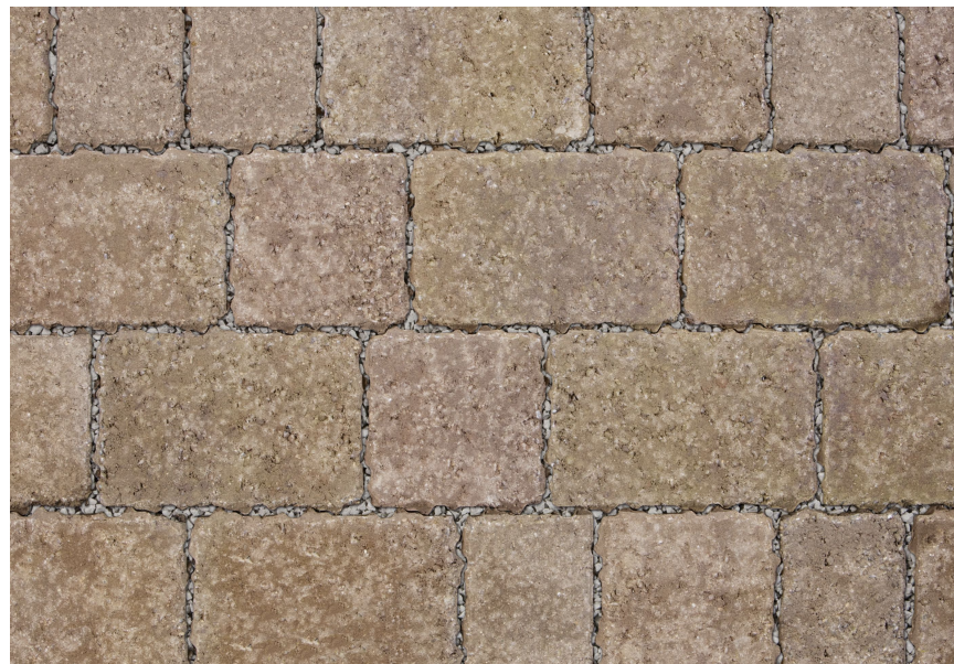
Marshalls Drivesett Tegula Priora - Harvest: driveway edging