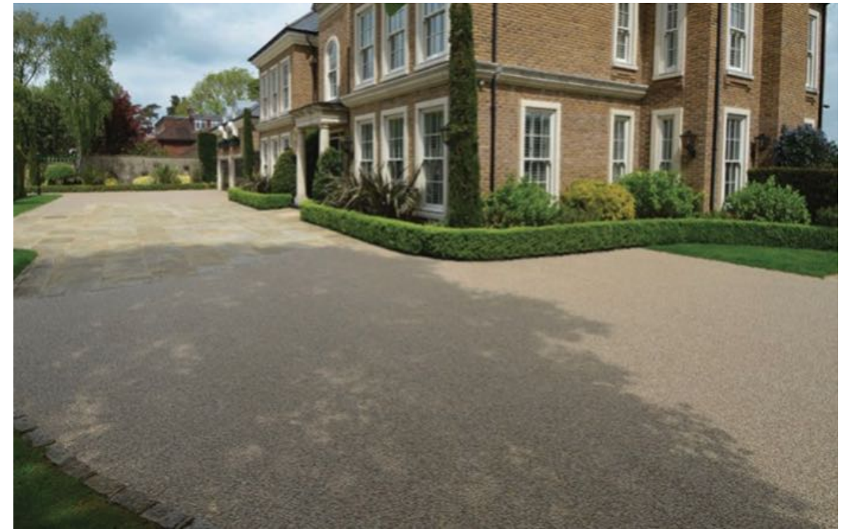
Resin bound driveways