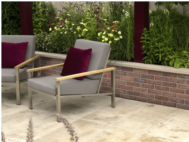
Brick faced retaining walls to match house walls