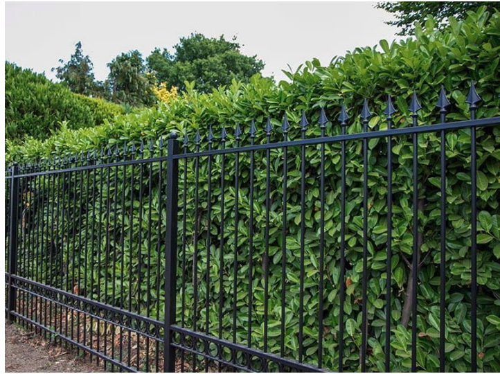
Black metal railings and hedge to front boundary