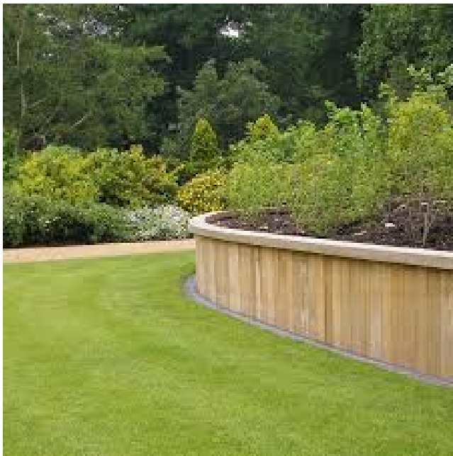
timber railway sleeper low retaining walls

DO NOT SCALE FROM THIS DRAWING. All dimensions must be verified by the main contractor before the commencement on site of any item of work or the preparation of shop drawings for their own work or that of sub-contractor or suppliers. This drawing is to be read in conjunction with all relevant documents. Any queries or discrepancies must be reported immediately to the architect. This document is copyright of DDWH Architects Ltd.