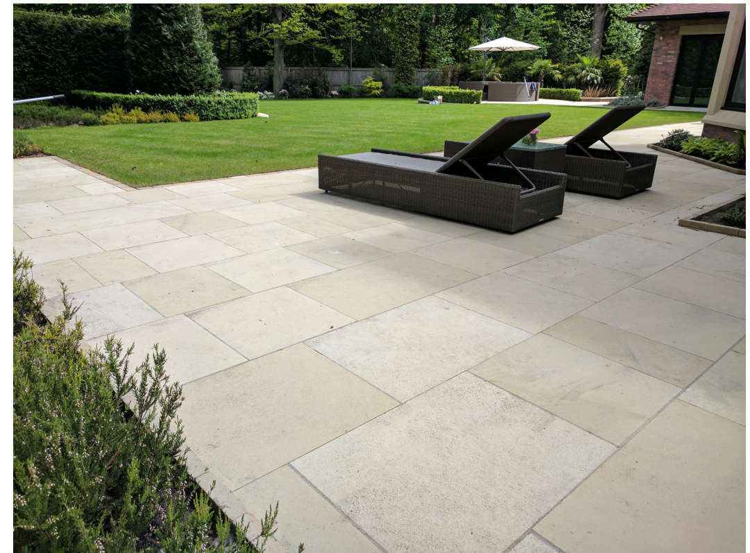
Sawn Yorkstone paving to rear terraces