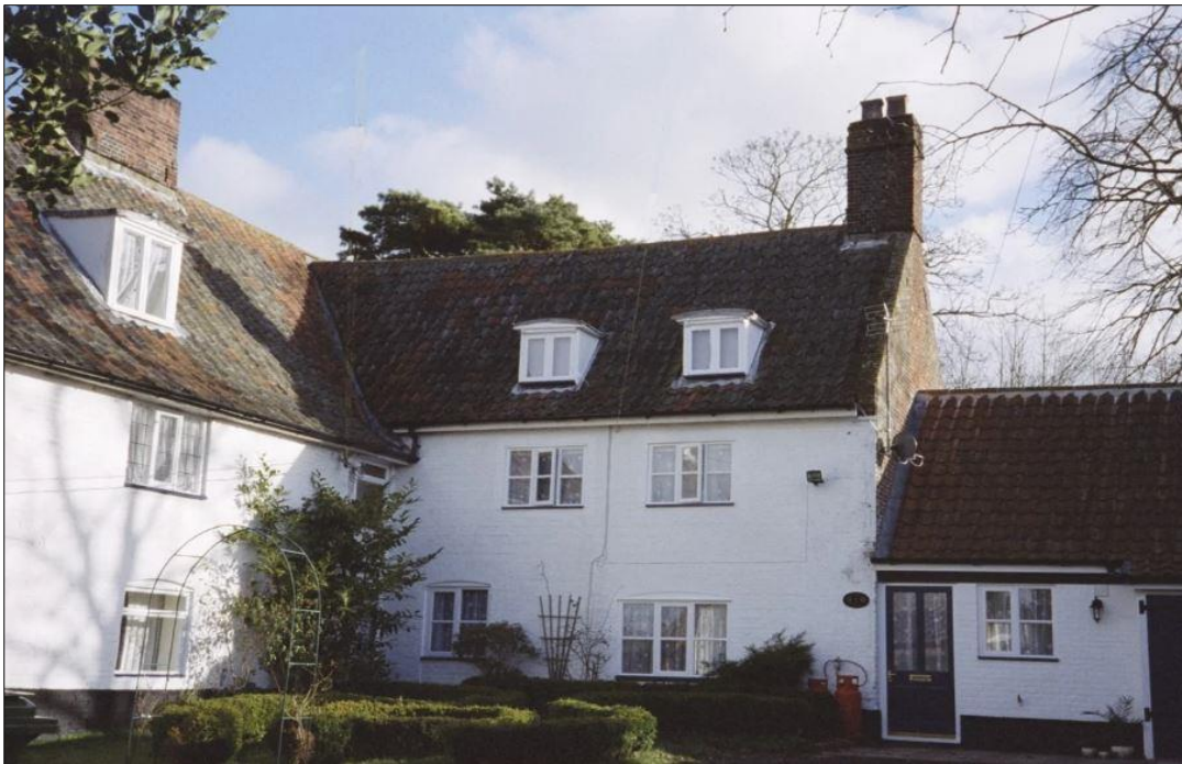
Existing West Elevation from Historic Archive