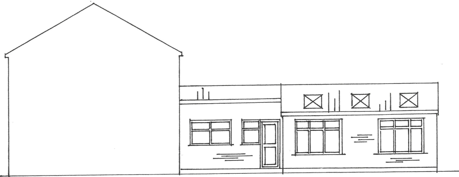
EXISTING NORTH ELEVATION 1:100