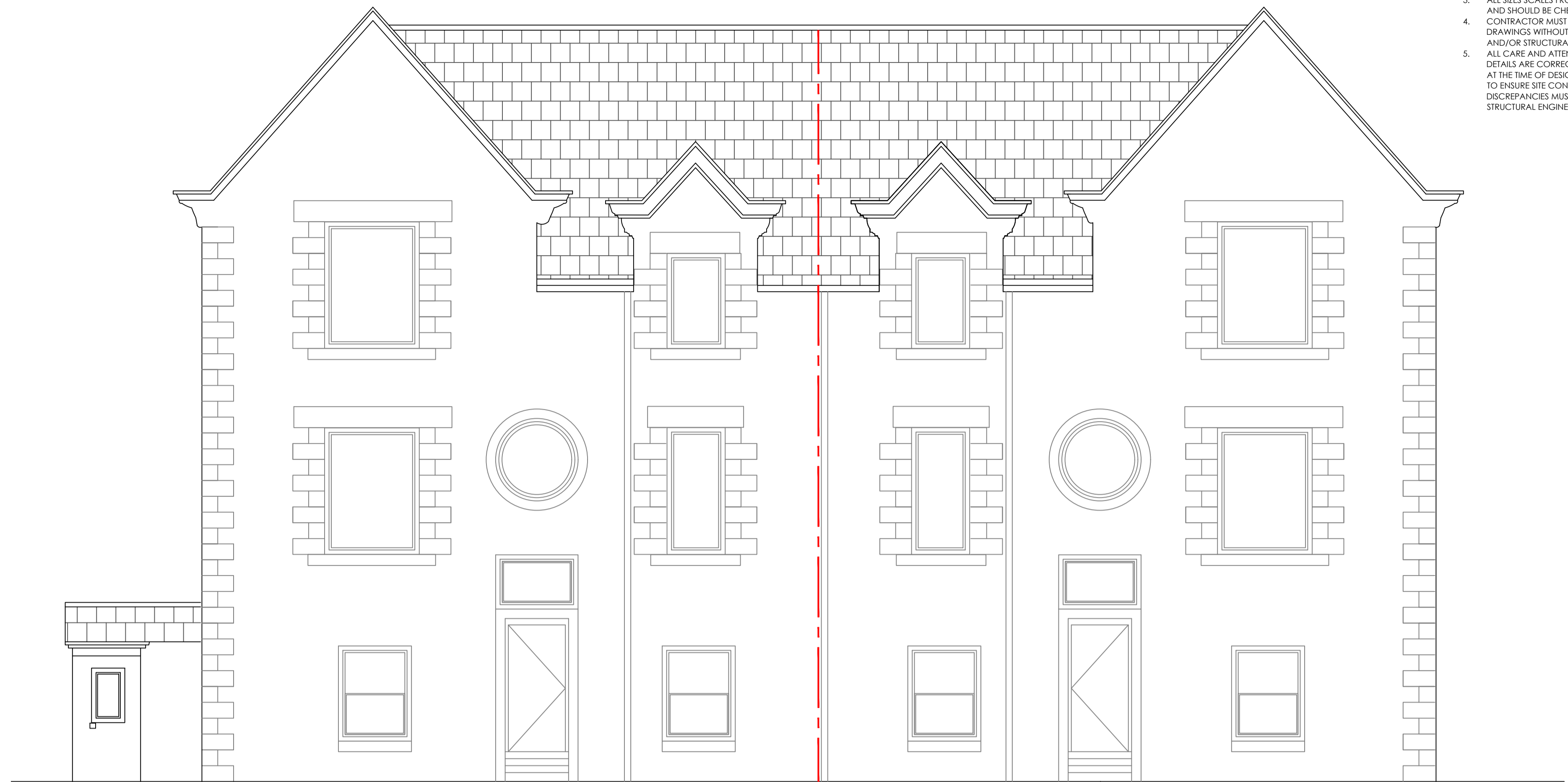
EXISTING FRONT ELEVATION (EAST)