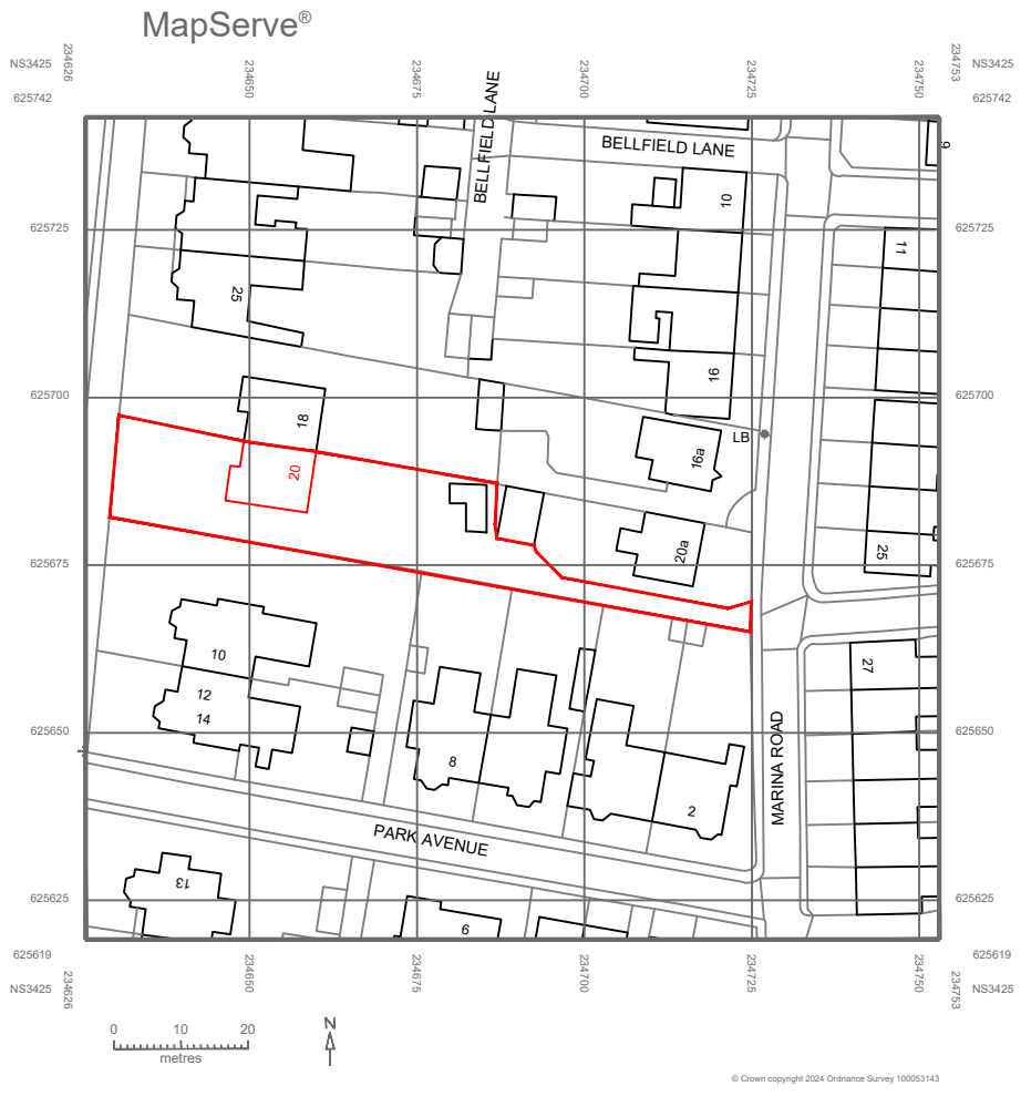
OS SITE LOCATION PLAN SCALE @ 1:1250