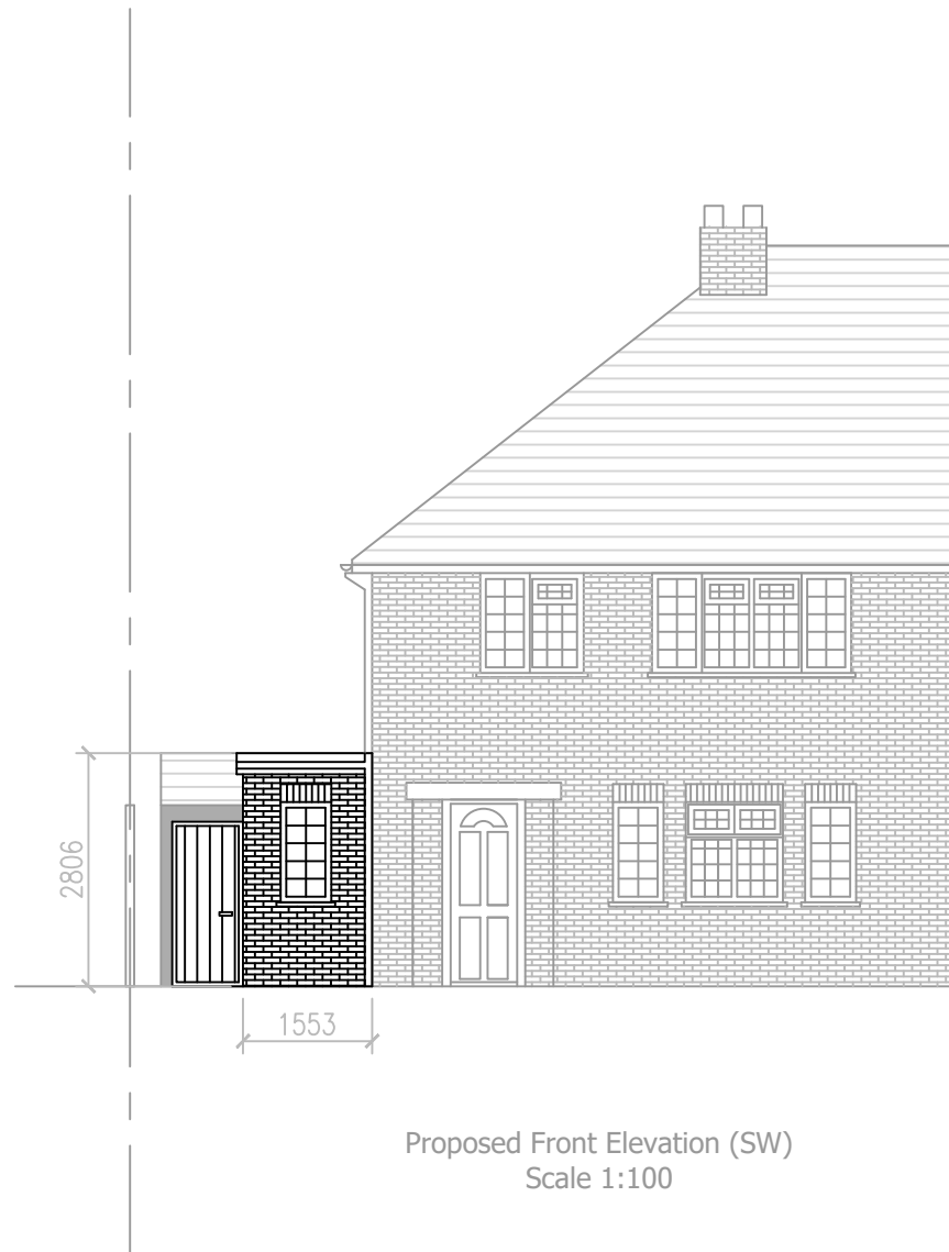
Proposed Front Elevation (SW) Scale 1:100