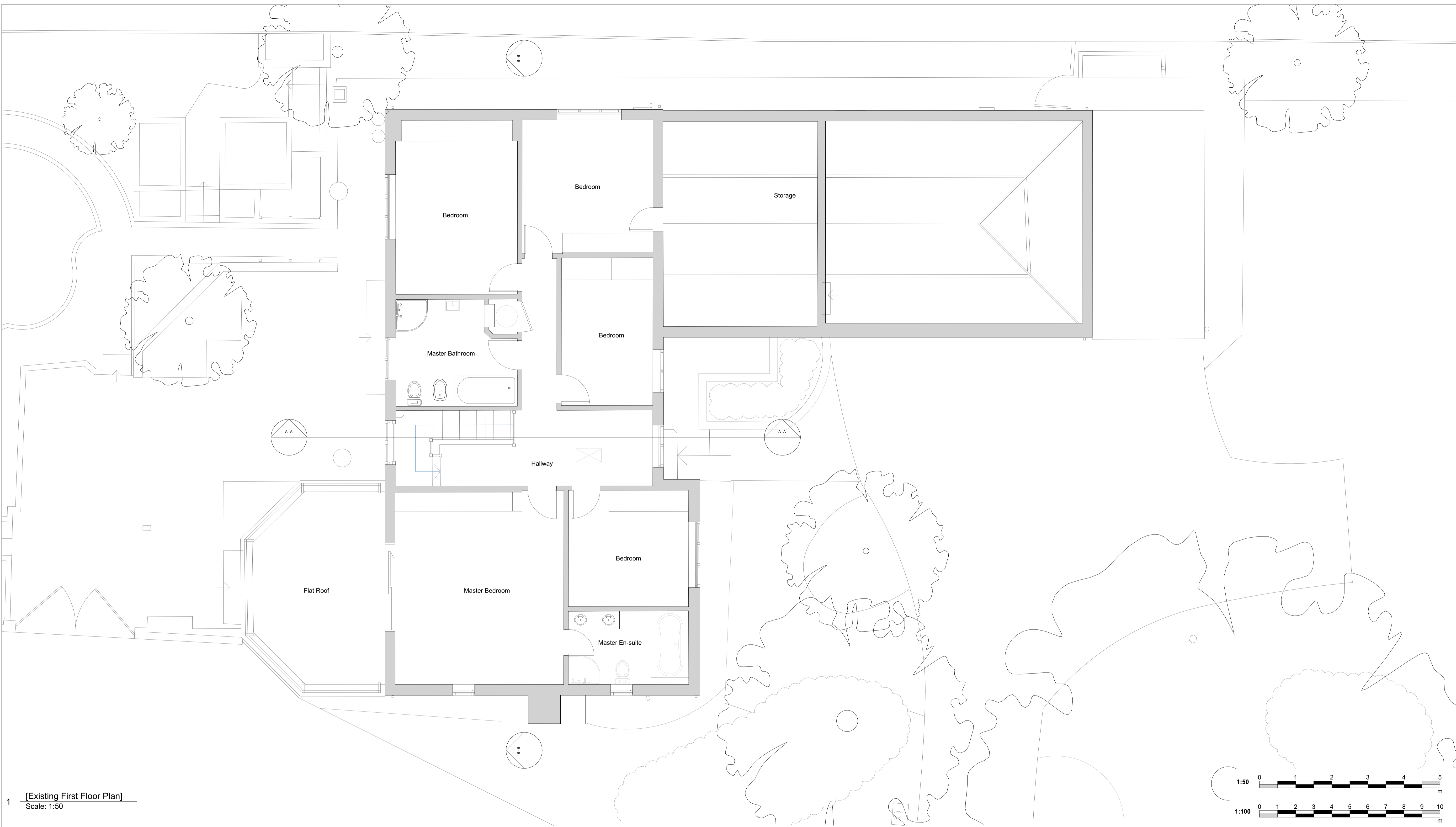
1 [Existing First Floor Plan] Scale: 1:50