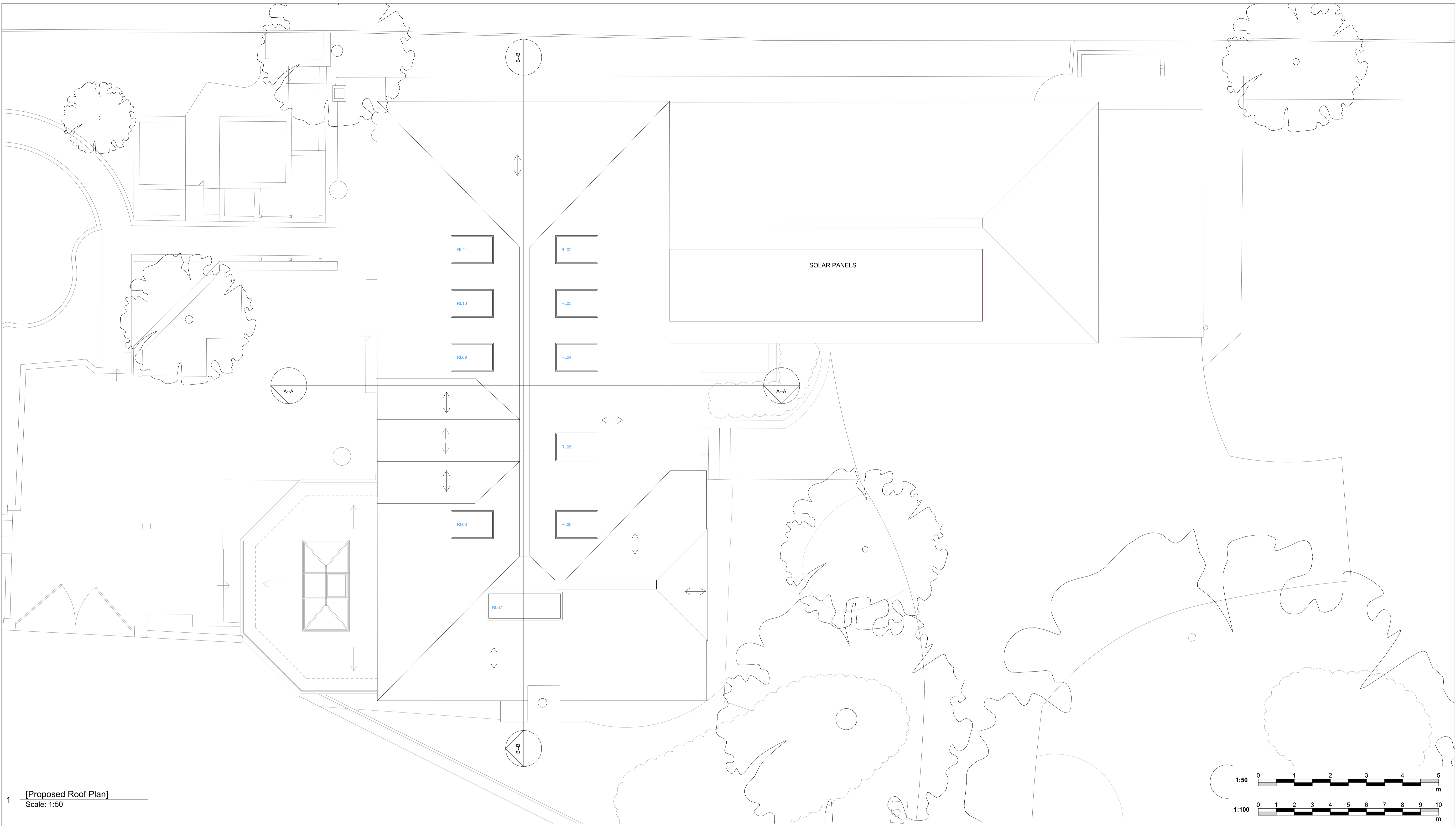
1 [Proposed Roof Plan] Scale: 1:50