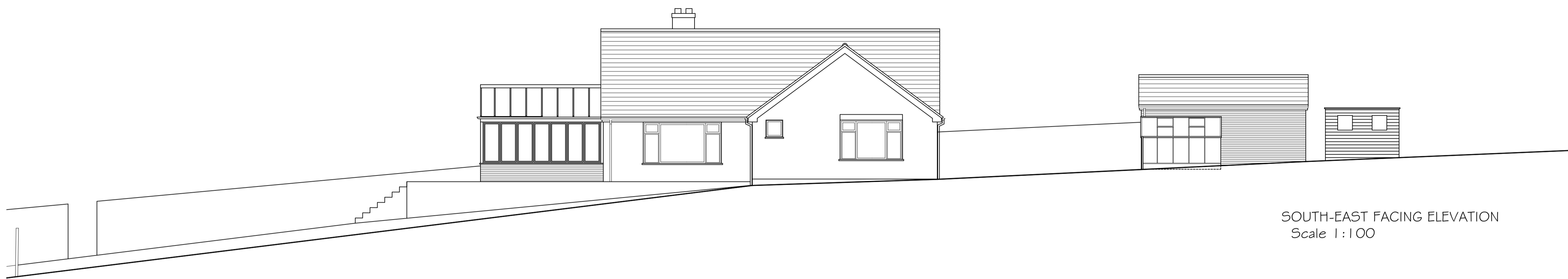
SOUTH-EAST FACING ELEVATION Scale 1:100