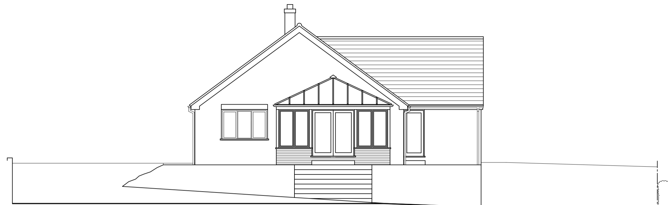
SOUTH-WEST FACING ELEVATION Scale 1:100