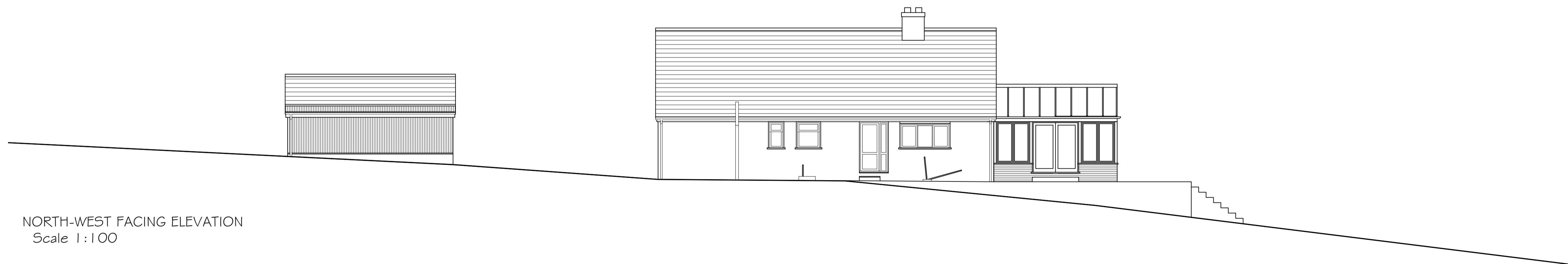
NORTH-WEST FACING ELEVATION Scale 1:100