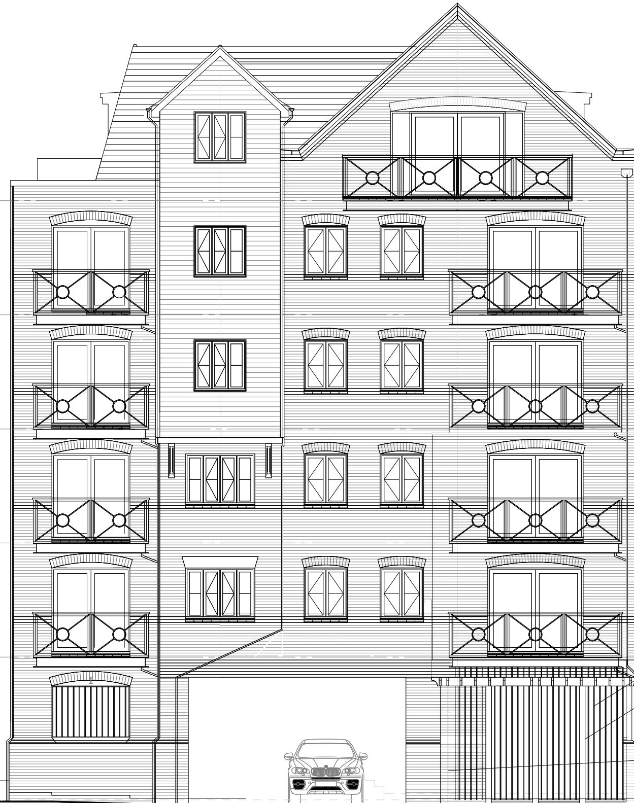
- REAR (SOUTH FACING) ELEVATION -

Mild steel railing to cycle enclosure (round bars matching railings to garage area openings) in accordance to plann. ref: