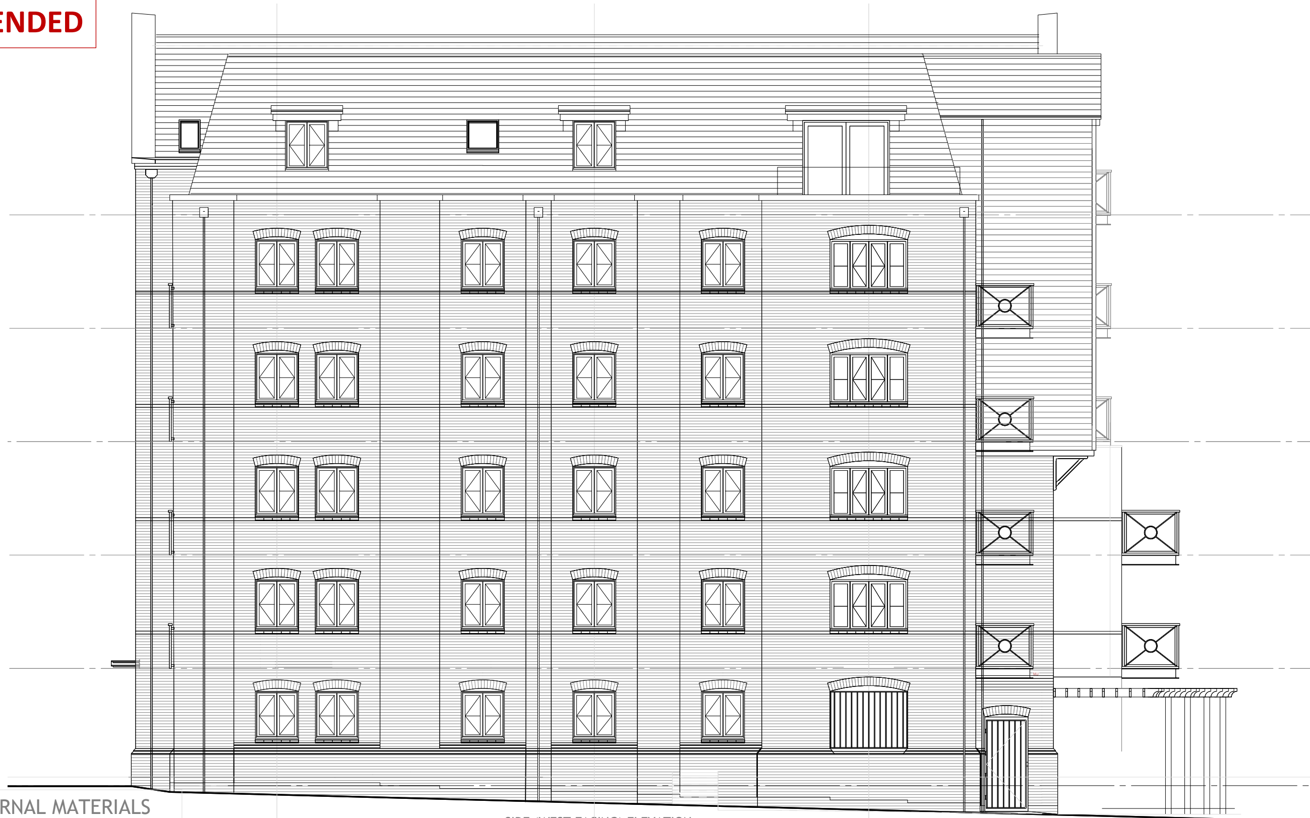
~ SIDE (WEST FACING) ELEVATION ~