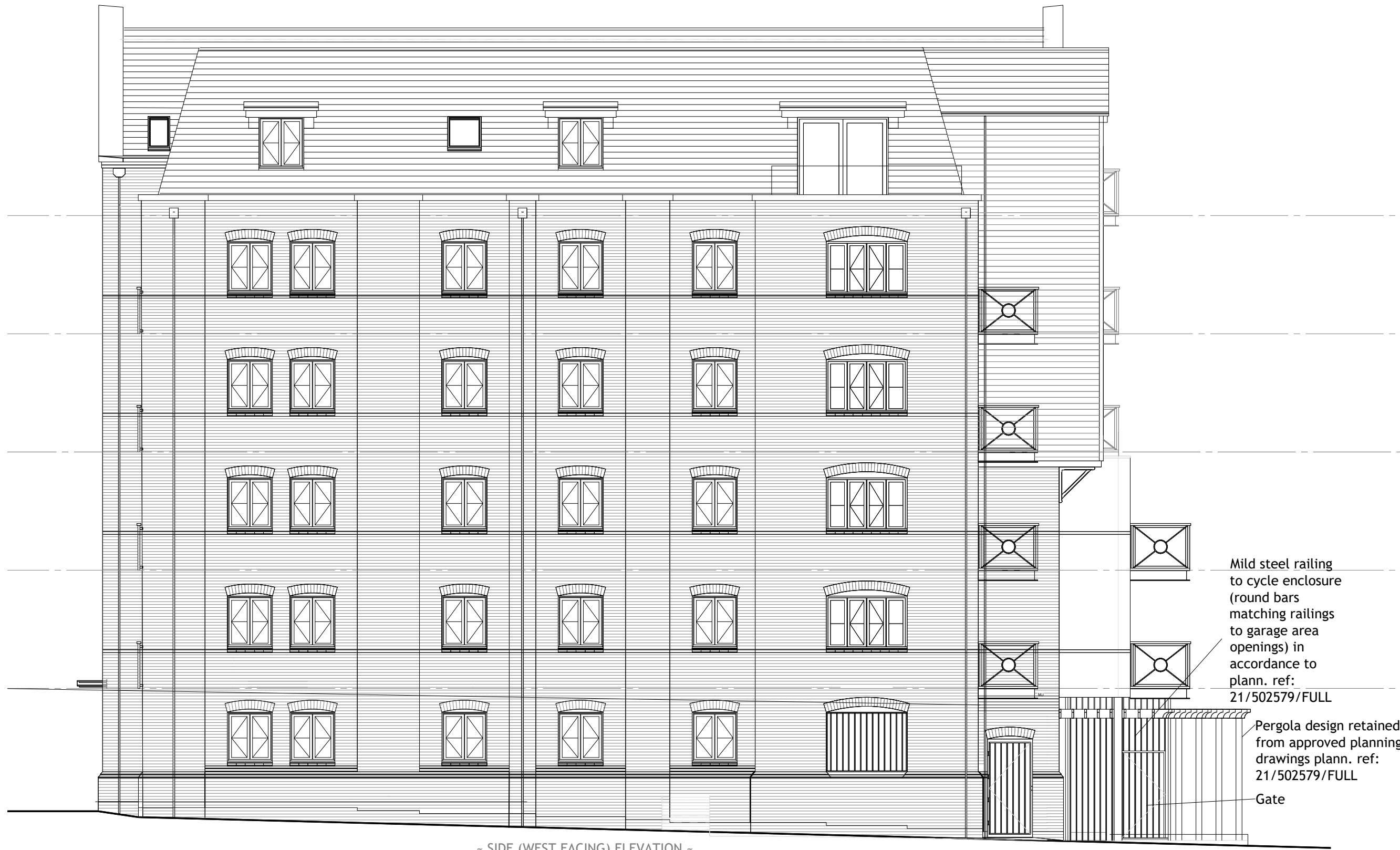
- SIDE (WEST FACING) ELEVATION -