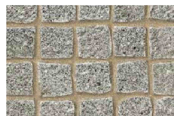
3 - Granite Setts