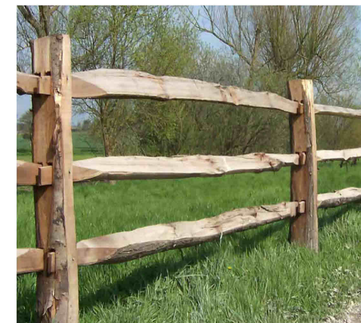
7 - Typical Post & Rail Fencing