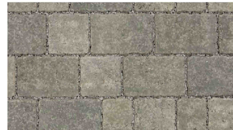
2 - Permeable Driveway Paving Details