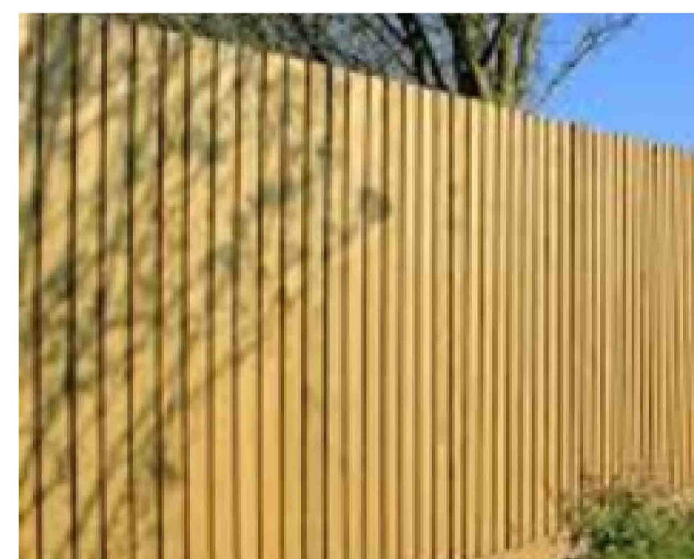
4 - Typical 1.8m High Close Boarded Fencing

Blocks to be laid on 50mm depth of 6mm clean crushed stone over 150-200mm depth of 20mm clean crushed stone with well defined edges over membrane, as per manufacturer's recommendations. Sub-base to be placed in layers not exceeding 75mm in thickness and should be suitably compacted with a plate vibrator before the next layer is placed. Each layer to be thoroughly compacted to the thickness required. The final thickness for the laying course should be 50mm. Paving units should be laid such that the joint profile interlocks with its neighbouring units. Blocks should be mixed simultaneously from a minimum of 3 packs, when laying.