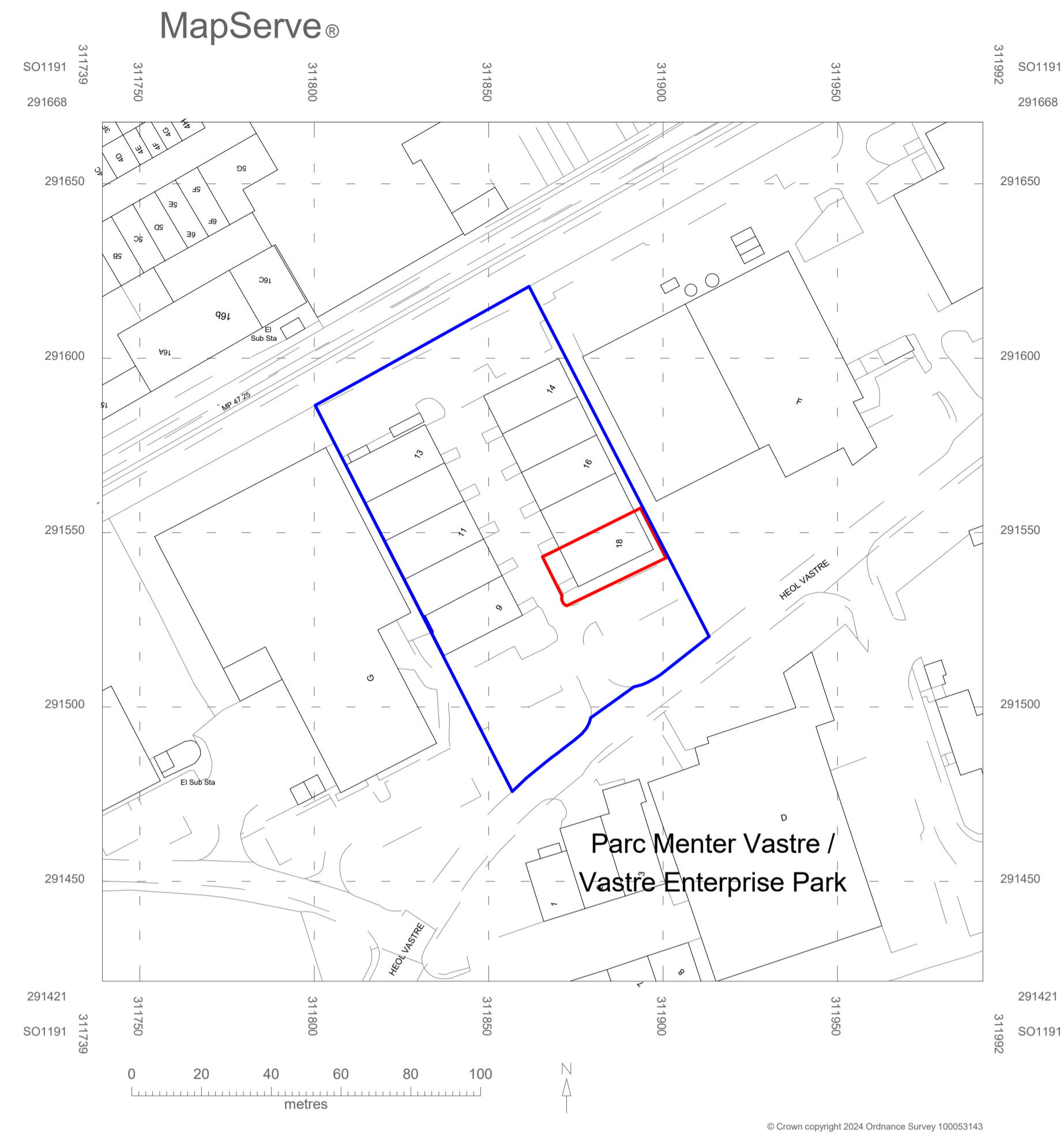
1 Location Plan 1 : 1250