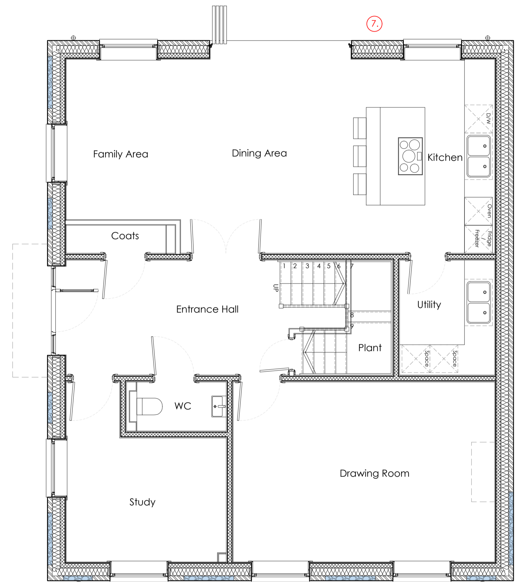
GROUND FLOOR PLAN Scale 1:50 @ A1 or 1:100 @ A3