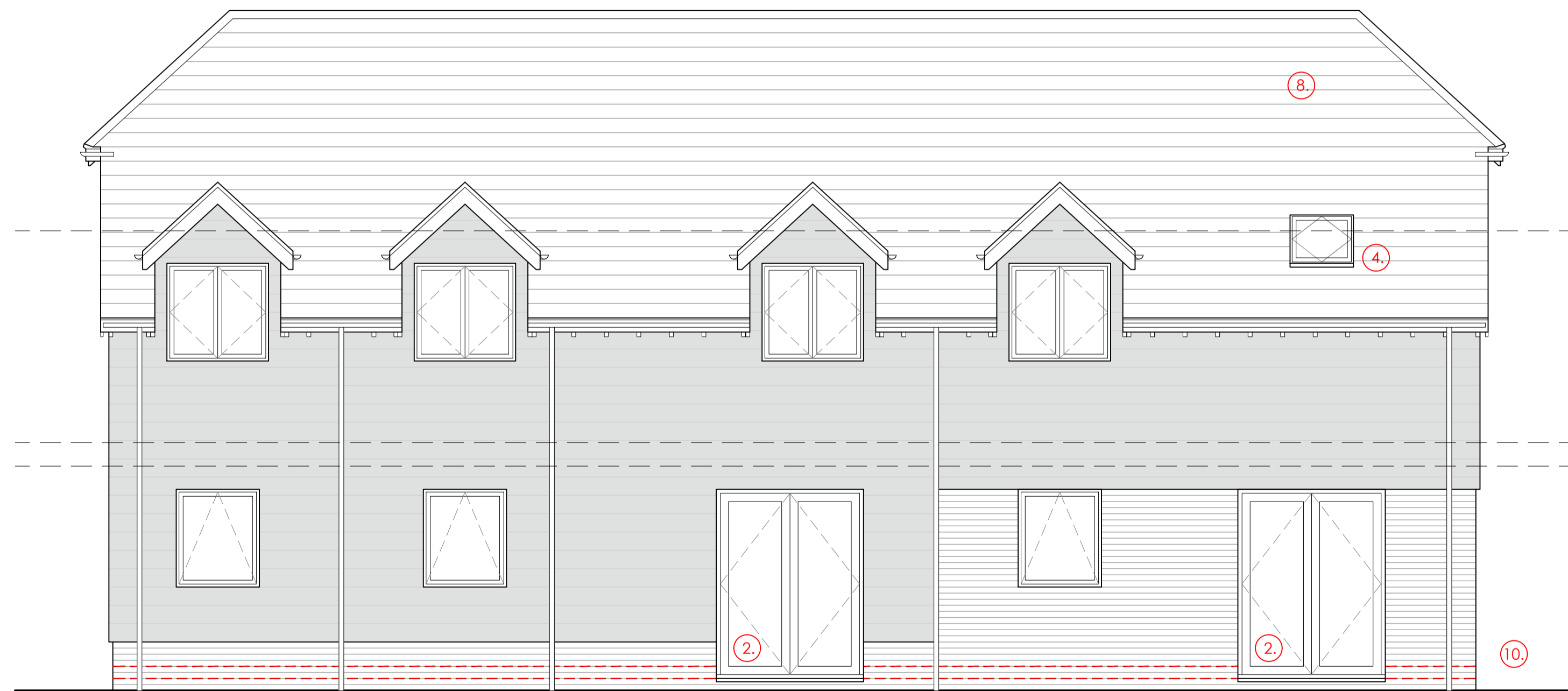
PLOT 2 SOUTH EAST ELEVATION Scale 1:50 @ A1 or 1:100 @ A3