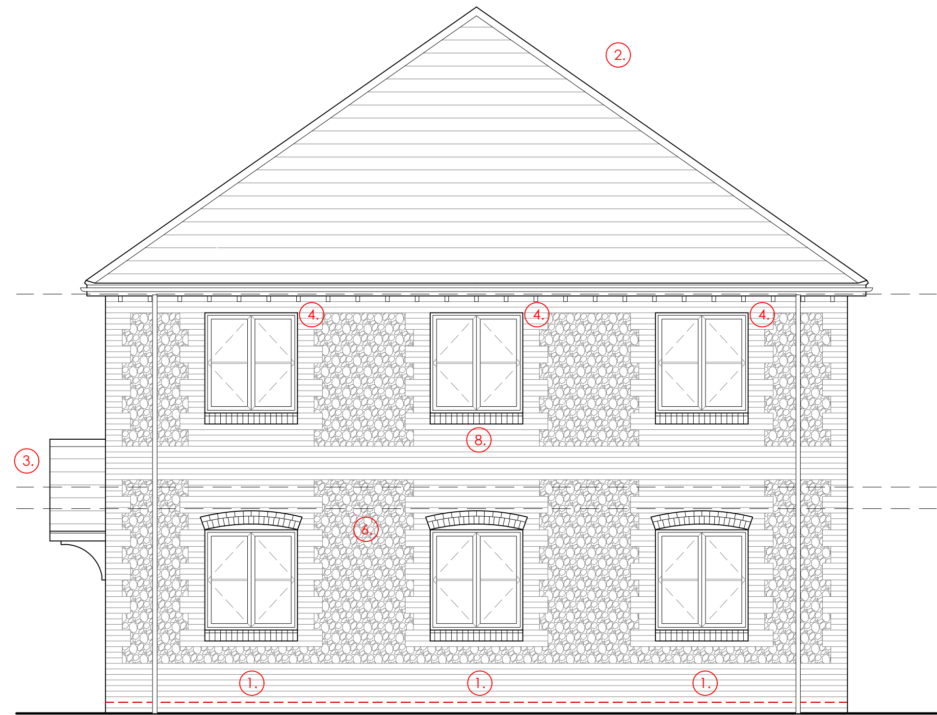
NORTH WEST ELEVATION Scale 1:50 @ A1 or 1:100 @ A3