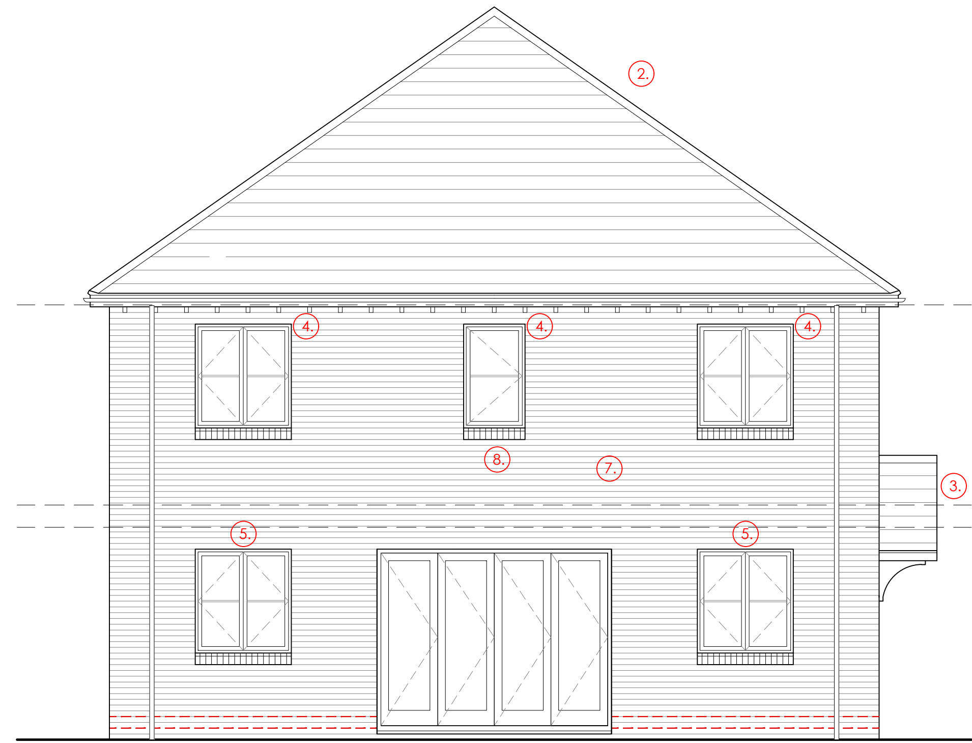
SOUTH EAST ELEVATION Scale 1:50 @ A1 or 1:100 @ A3