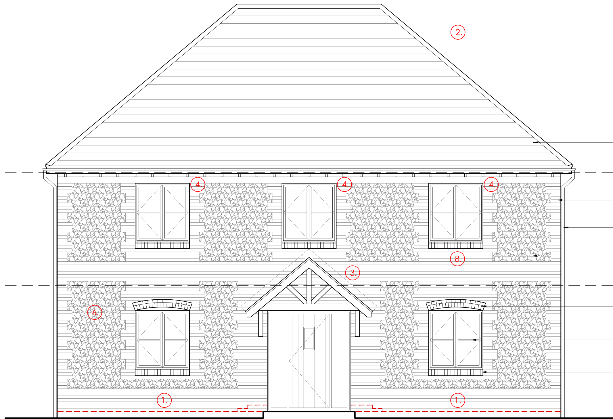
NORTH EAST ELEVATION Scale 1:50 @ A1 or 1:100 @ A3